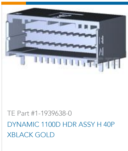
TE Part #1-1939638-0 DYNAMIC 1100D HDR ASSY H 40P XBLACK GOLD