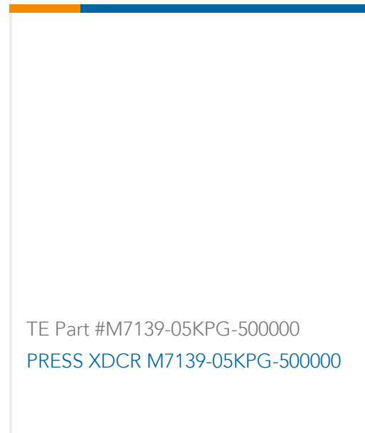
TE Part #M7139-05KPG-500000 PRESS XDCR M7139-05KPG-500000