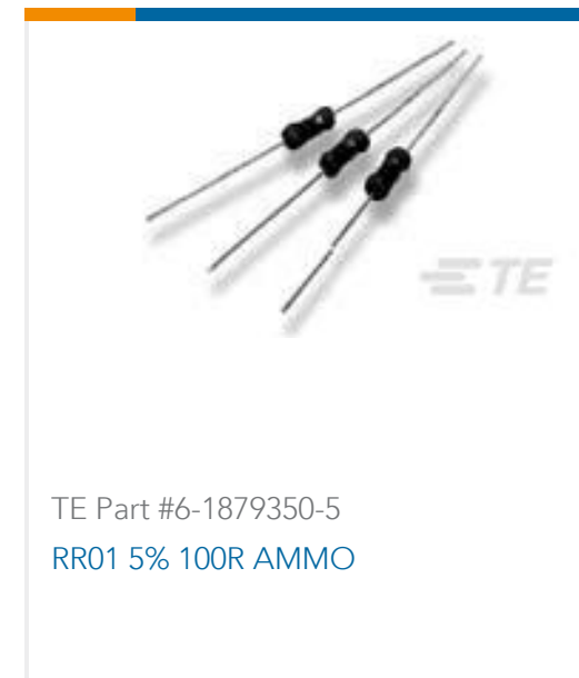
TE Part #6-1879350-5 RR01 5% 100R AMMO