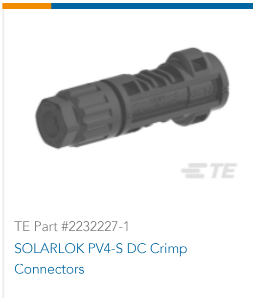
TE Part #2232227-1 SOLARLOK PV4-S DC Crimp Connectors