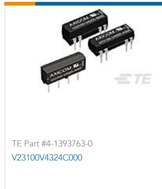
TE Part #4-1393763-0 V23100V4324C000