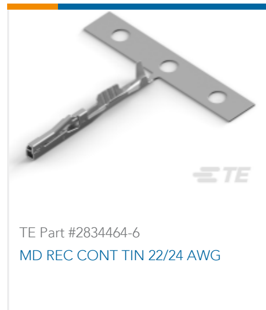
TE Part #2834464-6 MD REC CONT TIN 22/24 AWG