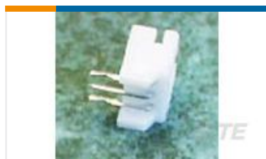
TE Part #1-440055-1 2.0MM,HDR,11POS,R/A