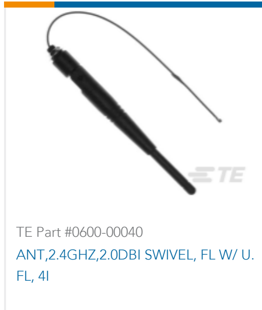
TE Part #0600-00040 ANT,2.4GHZ,2.0DBI SWIVEL, FL W/ U. FL, 4I