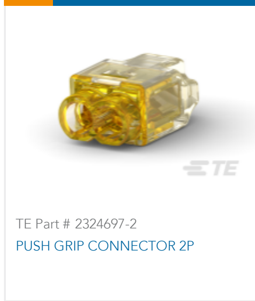
TE Part # 2324697-2 PUSH GRIP CONNECTOR 2P