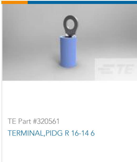
TE Part #320561 TERMINAL,PIDG R 16-14 6