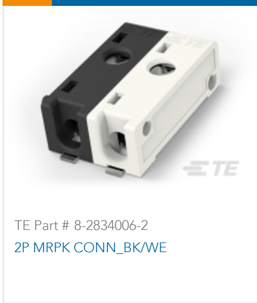
TE Part # 8-2834006-2 2P MRPK CONN_BK/WE