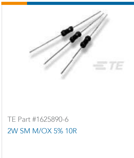
TE Part #1625890-6 2W SM M/OX 5% 10R