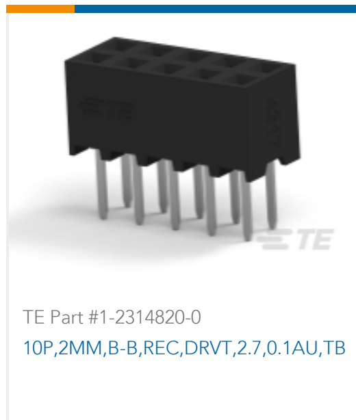
TE Part #1-2314820-0 10P,2MM,B-B,REC,DRVT,2,7,0.1AU,TB