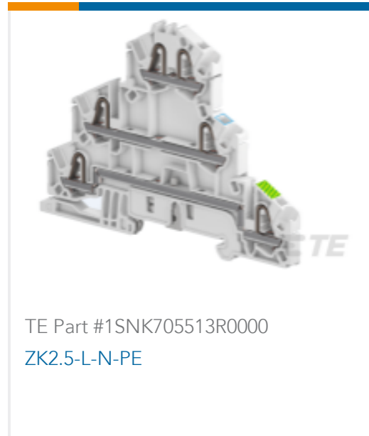
TE Part #1SNK705513R0000 ZK2.5-L-N-PE