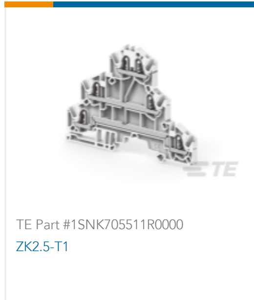
TE Part #1SNK705511R0000 ZK2.5-T1