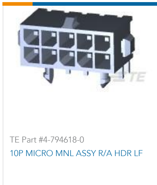
TE Part #4-794618-0 10P MICRO MNL ASSY R/A HDR LF