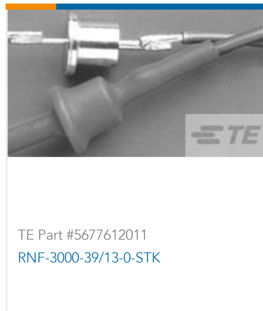
TE Part #5677612011 RNF-3000-39/13-0-STK