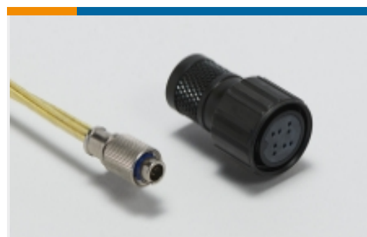
Standard Circular Connectors(124)