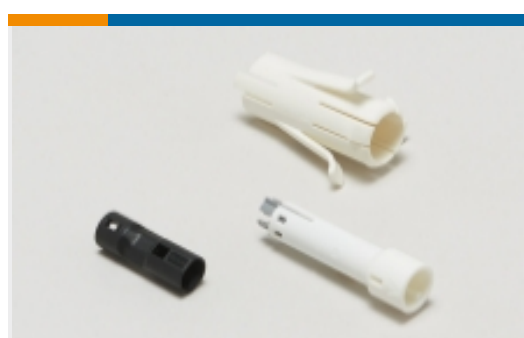
Plug & Socket Lighting Connector Accessories(1)