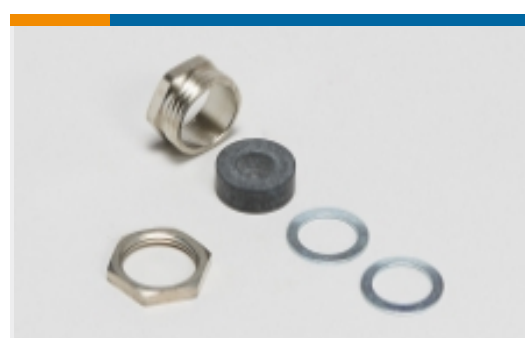
Circular Connector Hardware(1)