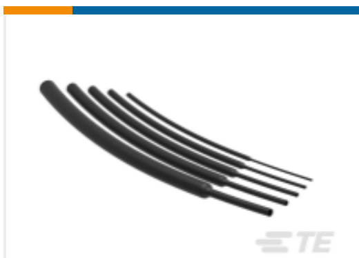
TE Part #5052942064 RNF100-0 Heat shrink Tubing