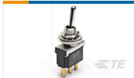
TE Part #4-6437630-8 FTH0904=MINIATURE TOGGLE