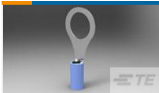
TE Part #328999 TERMINAL, PIDG R 16-14 3/8