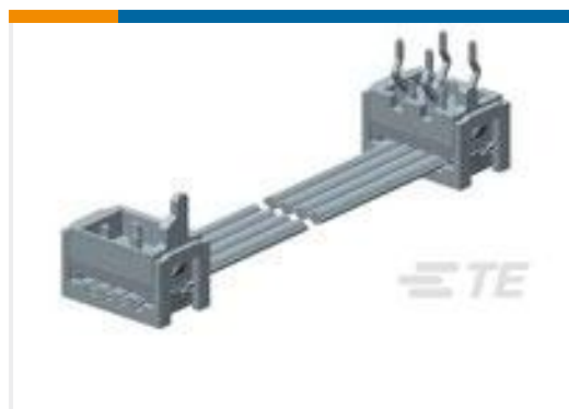
TE Part #2205074-2 CA MICRO-MATCH MOW-PB 16POS