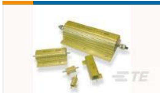
TE Part #8-1625966-0 HSA10 47R 5%