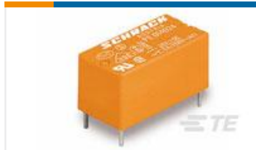
TE Part #1393219-6 PE014012