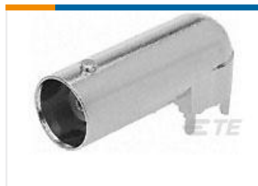
TE Part #5-1634513-1 BNC LOW PROFILE ELBOW SOCKET 50 OHMS