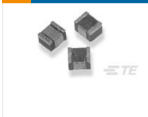
TE Part #6-1624113-0 3650 2A 0.43uH 5% 2K RL