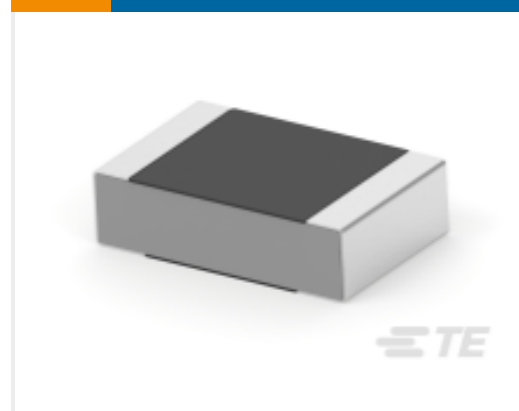
TE Part #2-1614883-9 CPF 0805 18R 0.1% 25PPM 5K RL