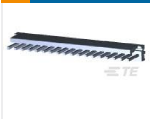
TE Part #1-640445-8 18P MTA156 HDR ASSY FL/STR SN