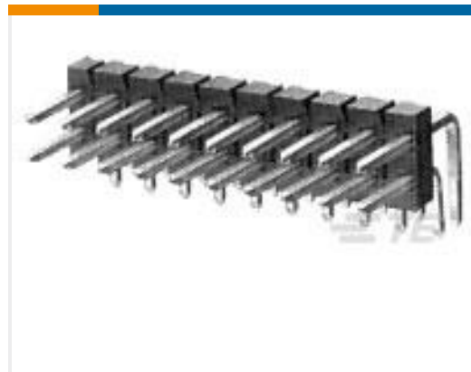
TE Part #3-102973-0 60 MODII HDR DRST B/A .100CL