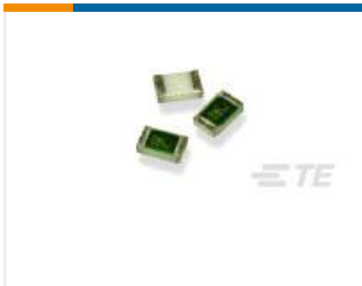
TE Part #9-1614890-2 CPF 0805 53R6 0.1% 25PPM 1K RL