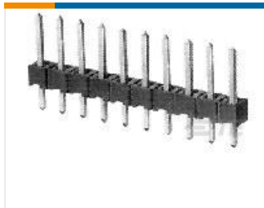
TE Part #102976-2 02 MODII HDR SRST B/A .100CL