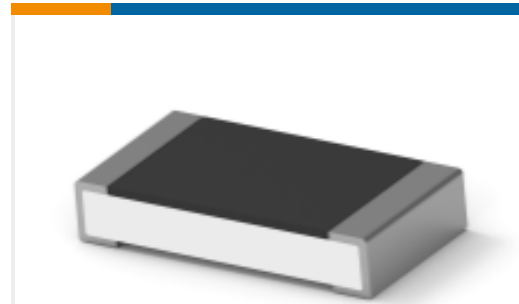
TE Part #7-2176389-3 RQ 1206 604R 0.1% 10PPM 5K RL