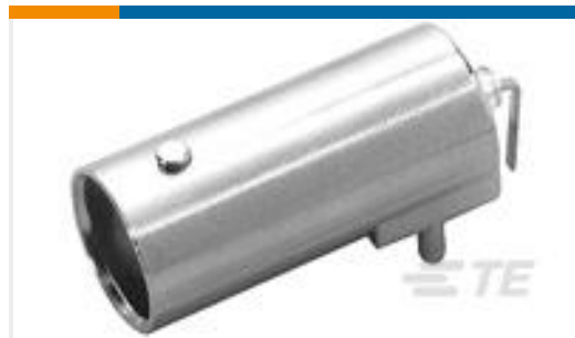
TE Part #5414373-1 JACK,PCB,50 OHM,BNC