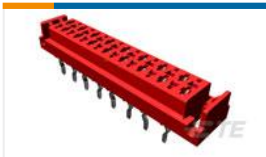
TE Part #1-338068-0 MICRO-MATCH FTE,10P