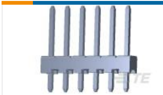
TE Part #3-644456-6 06P MTA100 HDR ASSY (NARROW)