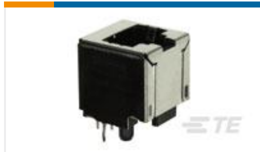
TE Part #6368150-1 MJ,TE,8P,CAT5,SHIELDED