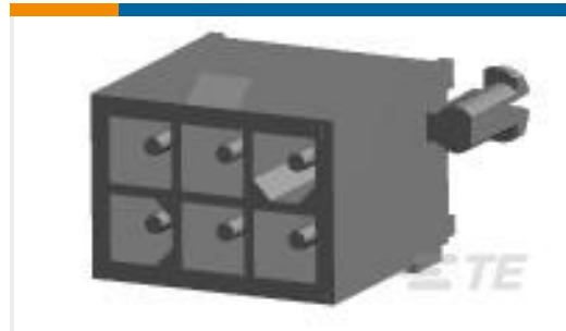
TE Part #1-770178-0 06P MINI-UMNL ASSY VO SNNI*