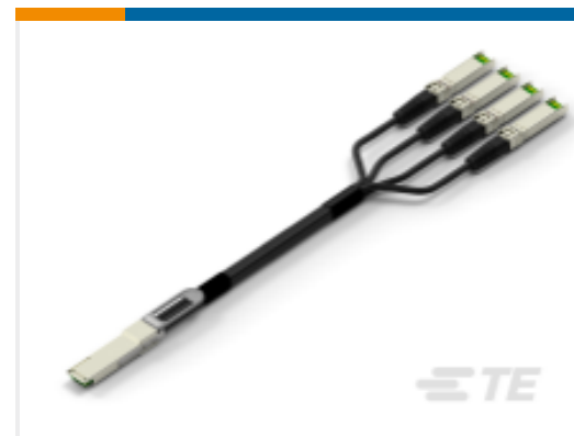
TE Part # CAT-C11-N490333 QSFP28-Four SFP+ Cable Assembly: 30 AWG