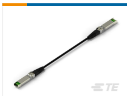
TE Part # 4-2821224-5 SFP56 DIRECT ATTACH CA, 3M, 26AWG