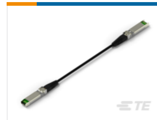
TE Part # CAT-C11-N4901114 SFP28 to SFP28 Cable Assembly: 30 AWG