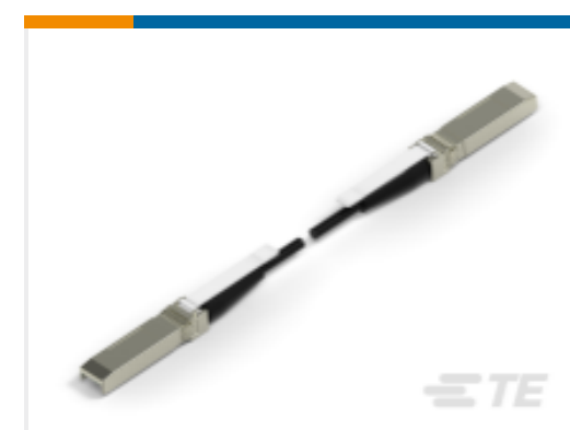
TE Part # CAT-C11-H5 SFP+ to SFP+ I/O Cable Assembly: 24 AWG