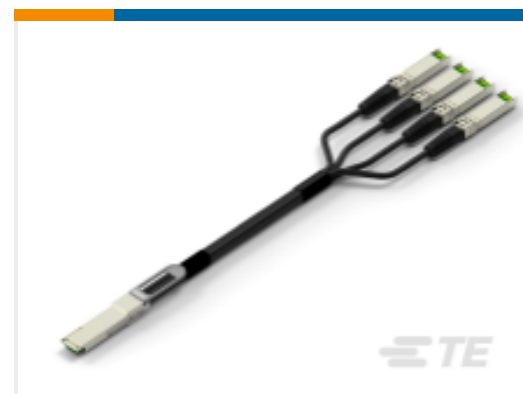
TE Part # CAT-Q17-N49011 QSFP56-Four SFP56 Cable Assembly: 30 AWG