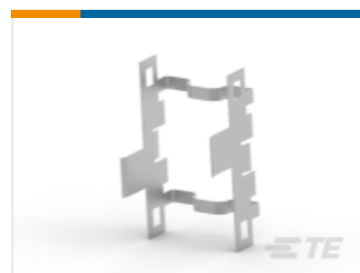
TE Part # CAT-SF59-AC229 SFP accessories