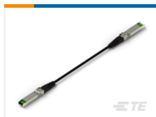
TE Part # 4-2334985-2 SFP56 DIRECT ATTACH CA, 1M, 32AWG