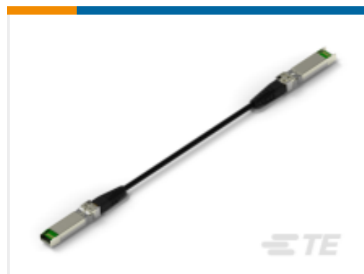
TE Part # CAT-C11-N49011 SFP28 to SFP28 Cable Assembly: 26 AWG