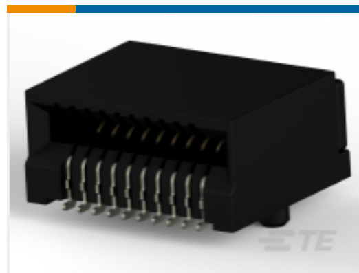
TE Part # 2110759-1 PT CONN ASSY 20 POS 16G SFP