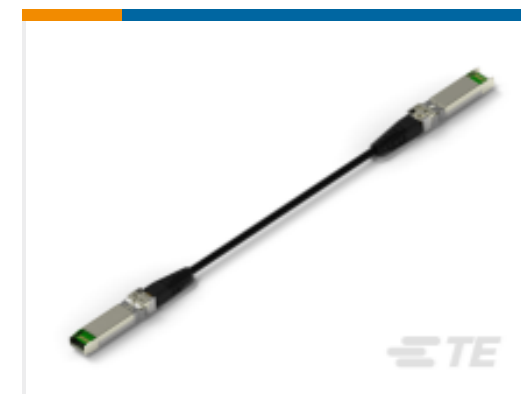
TE Part # 4-2821222-5 SFP56 DIRECT ATTACH CA, 2M, 30AWG