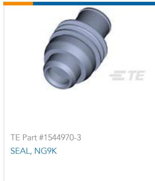
TE Part #1544970-3 SEAL, NG9K