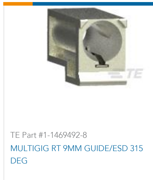
TE Part #1-1469492-8 MULTIGIG RT 9MM GUIDE/ESD 315 DEG