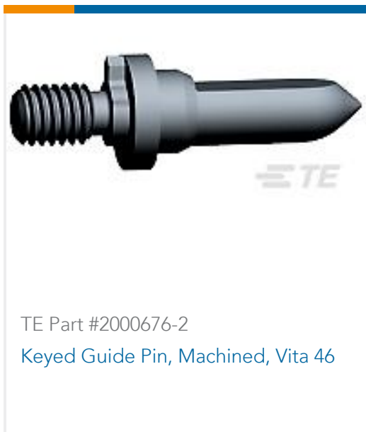
TE Part #2000676-2 Keyed Guide Pin, Machined, Vita 46