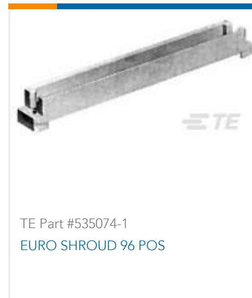
TE Part #535074-1 EURO SHROUD 96 POS