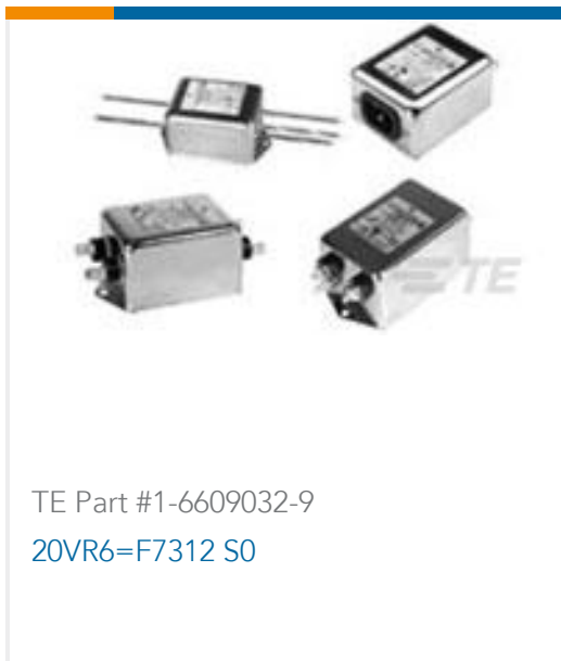
TE Part #1-6609032-9 20VR6=F7312 S0