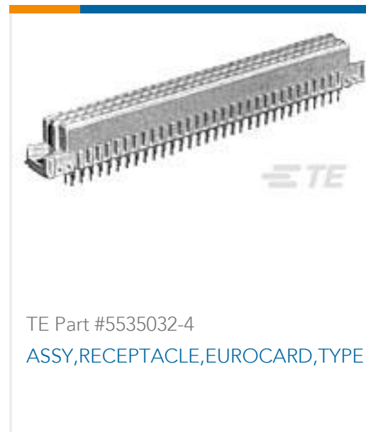
TE Part #5535032-4 ASSY,RECEPTACLE,EUROCARD,TYPE DEG