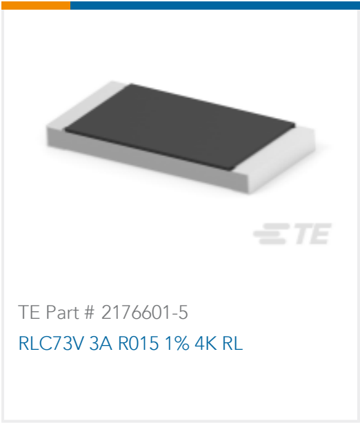
TE Part # 2176601-5 RLC73V 3A R015 1% 4K RL