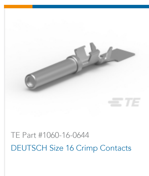
TE Part #1060-16-0644 DEUTSCH Size 16 Crimp Contacts