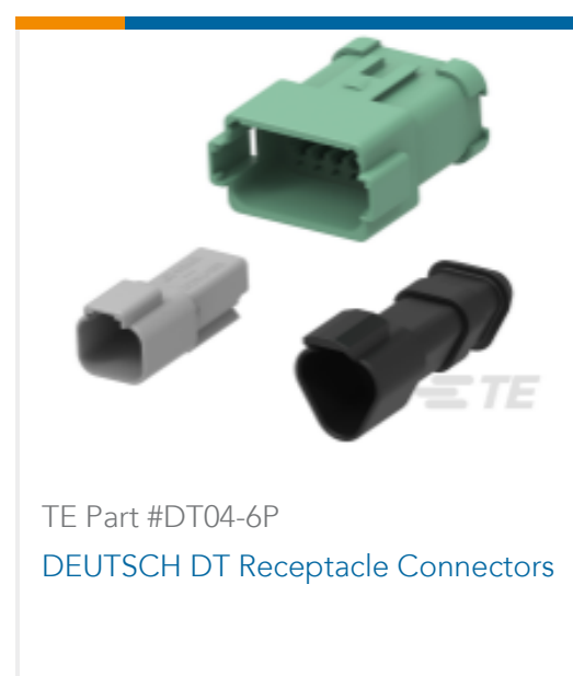
TE Part #DT04-6P DEUTSCH DT Receptacle Connectors