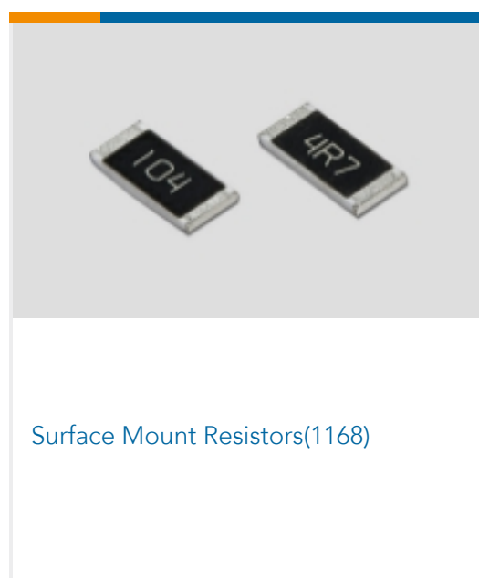
Surface Mount Resistors(1168)