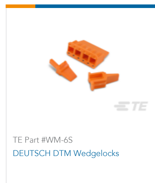
TE Part #WM-6S DEUTSCH DTM Wedgelocks