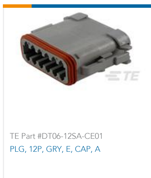
TE Part #DT06-12SA-CE01 PLG, 12P, GRY, E, CAP, A