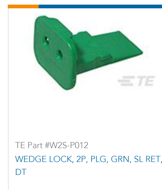
TE Part #W2S-P012 WEDGE LOCK, 2P, PLG, GRN, SL RET, DT