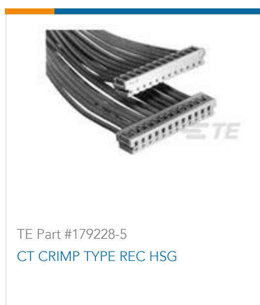
TE Part #179228-5 CT CRIMP TYPE REC HSG