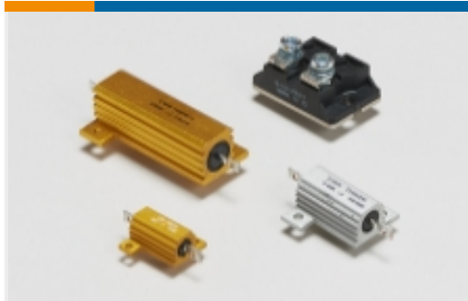
Chassis Mount Resistors(34)