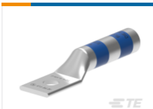
TE Part #EN3750-475 TCTL-1-5/16-U