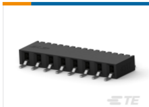
TE Part #2307725-8 8P, 2MM, B-B, REC, SRHZ, SMD, 0.1AU, TR