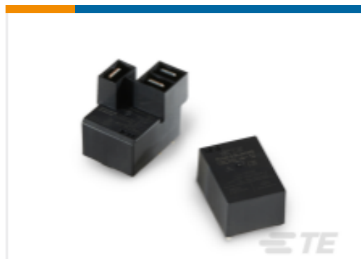
TE Part #1558666-6 PCB Power Relay: 30 amp, Monostable DC