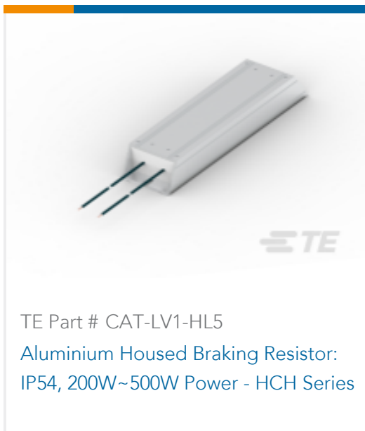
TE Part # CAT-LV1-HL5 Aluminium Housed Braking Resistor: IP54, 200W-500W Power - HCH Series