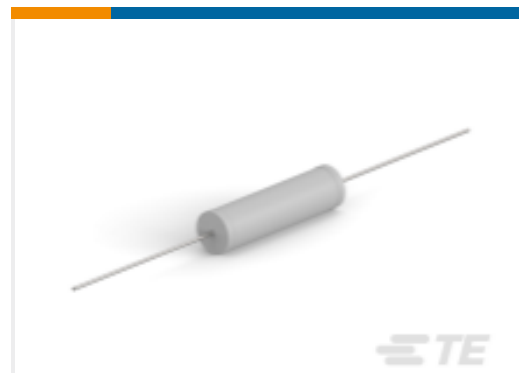
TE Part #9-2176414-1 7W STD M/OX 5% 110K