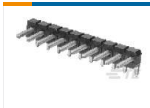
TE Part #6-103325-5 15 MODII HD SRRA B/A .100CL,LF