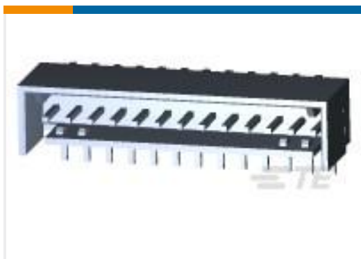
TE Part #3-644488-3 13P MTA100 SHRDR HDR F/L R/A SN