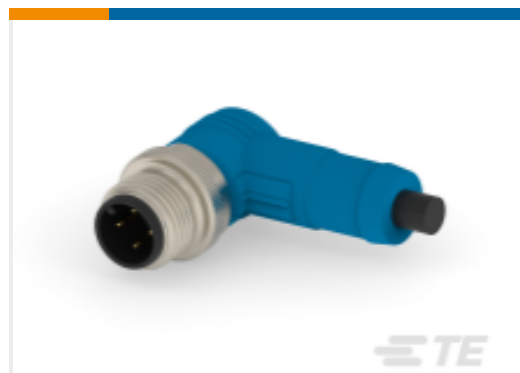
TE Part #T4151210004-003 RPC-M12-MR-4CON-PVC-1.5