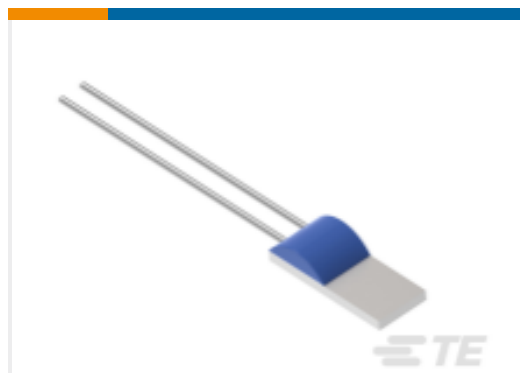
TE Part #NB-PTCO-166 Pt100, 2.0x5.0, Class C, PTFD101C1A0