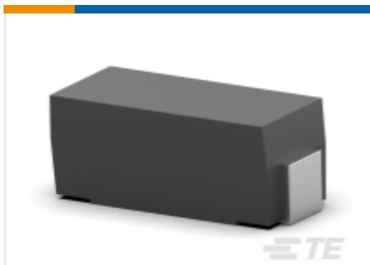
TE Part #7-2176460-2 SMF 7W 1M0 5% Taped