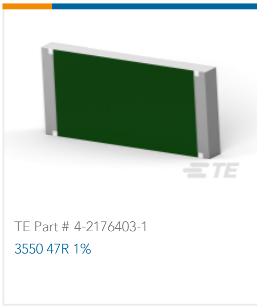
TE Part # 4-2176403-1 3550 47R 1%