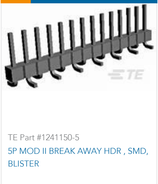
TE Part #1241150-5 5P MOD II BREAK AWAY HDR , SMD, BLISTER