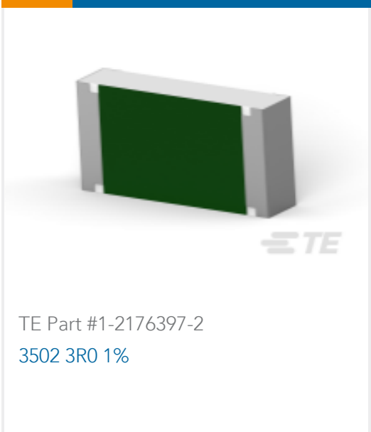
TE Part #1-2176397-2 3502 3R0 1%