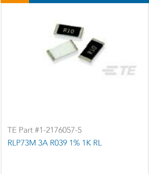
TE Part #1-2176057-5 RLP73M 3A R039 1% 1K RL