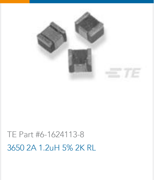
TE Part #6-1624113-8 3650 2A 1.2uH 5% 2K RL