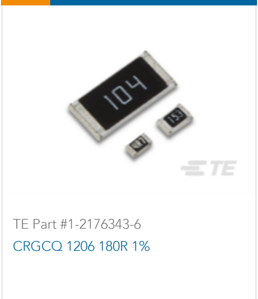
TE Part #1-2176343-6 CRGCQ 1206 180R 1%