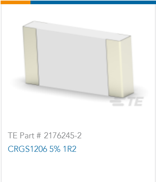
TE Part # 2176245-2 CRGS1206 5% 1R2