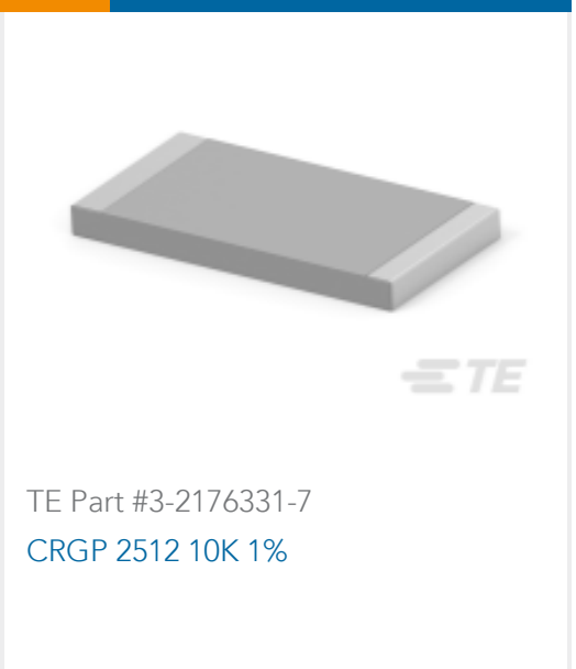
TE Part #3-2176331-7 CRGP 2512 10K 1%