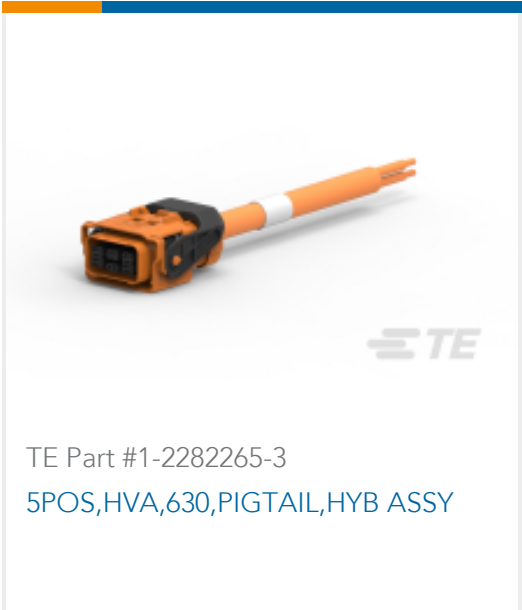
TE Part #1-2282265-3 5POS,HVA,630,PIGTAIL,HYB ASSY