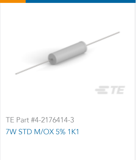
TE Part #4-2176414-3 7W STD M/OX 5% 1K1