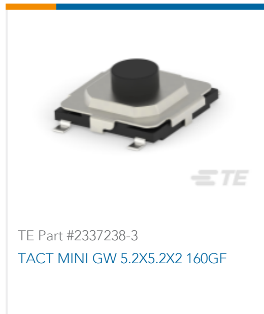
TE Part #2337238-3 TACT MINI GW 5.2X5.2X2 160GF