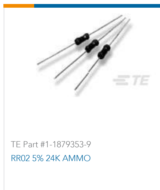
TE Part #1-1879353-9 RR02 5% 24K AMMO