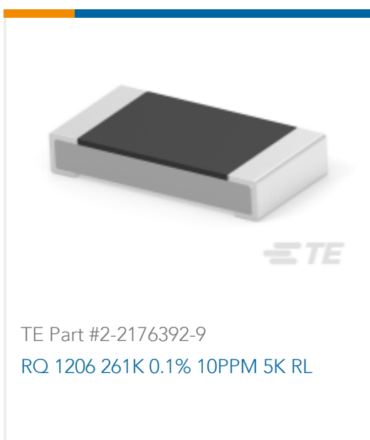
TE Part #2-2176392-9 RQ 1206 261K 0.1% 10PPM 5K RL