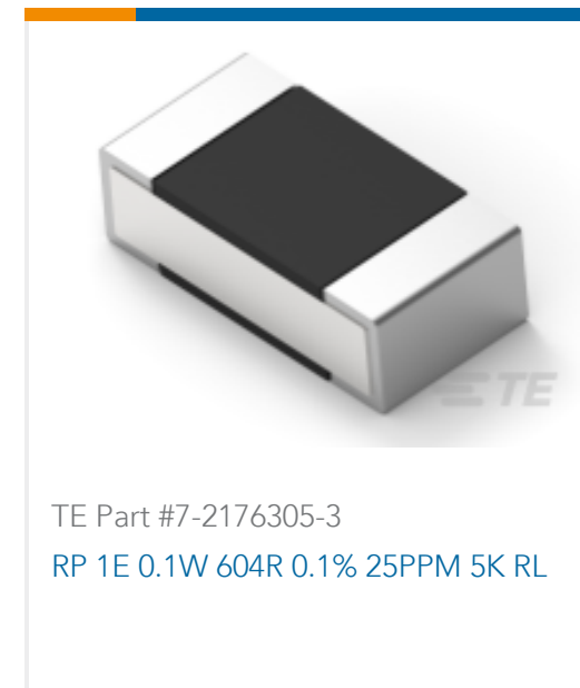
TE Part #7-2176305-3 RP 1E 0.1W 604R 0.1% 25PPM 5K RL