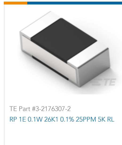
TE Part #3-2176307-2 RP 1E 0.1W 26K1 0.1% 25PPM 5K RL