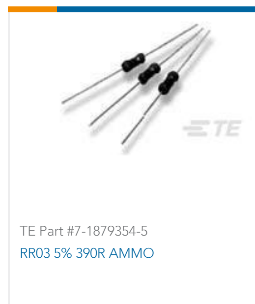
TE Part #7-1879354-5 RR03 5% 390R AMMO