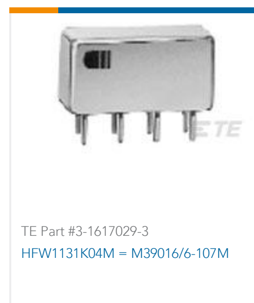
TE Part #3-1617029-3 HFW1131K04M = M39016/6-107M