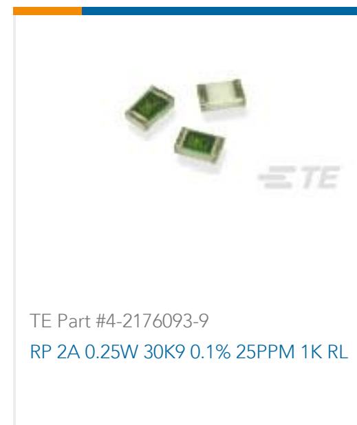
TE Part #4-2176093-9 RP 2A 0.25W 30K9 0.1% 25PPM 1K RL