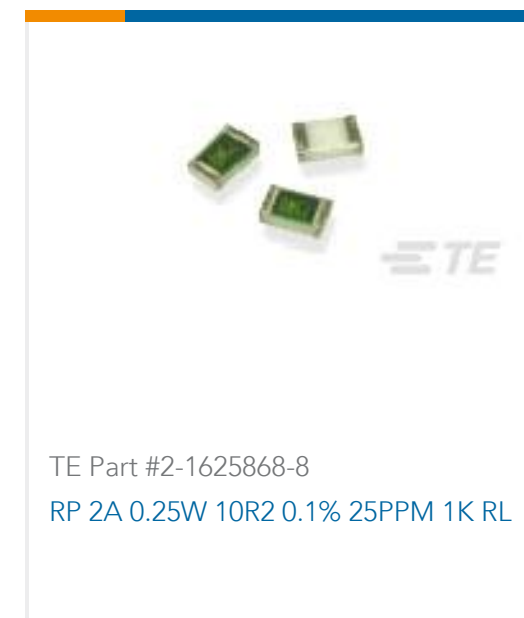
TE Part #2-1625868-8 RP 2A 0.25W 10R2 0.1% 25PPM 1K RL