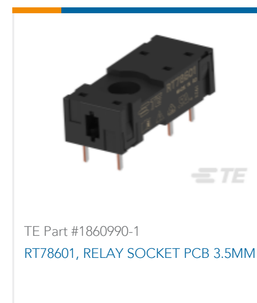
TE Part #1860990-1 RT78601, RELAY SOCKET PCB 3.5MM