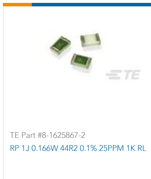
TE Part #8-1625867-2 RP 1J 0.166W 44R2 0.1% 25PPM 1K RL