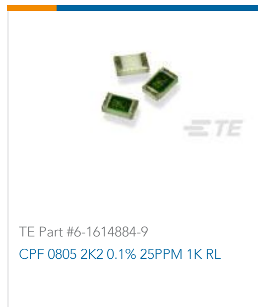
TE Part #6-1614884-9 CPF 0805 2K2 0.1% 25PPM 1K RL