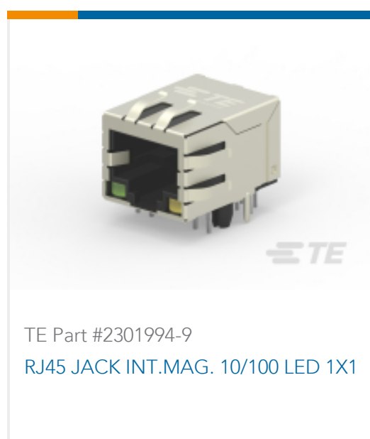
TE Part #2301994-9 RJ45 JACK INT.MAG. 10/100 LED 1X1