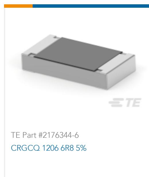
TE Part #2176344-6 CRGCQ 1206 6R8 5%