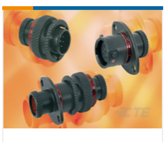
TE Part #ASDD106-09SN-HE INLINE RECEPT ASSY ASDD 9 WAY