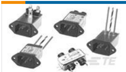
TE Part #6609053-6 6EHT3=F7665 S0