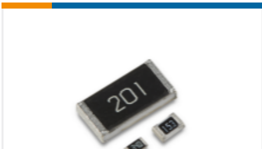
TE Part #1-2176330-9 CRGP 2010 330R 1%