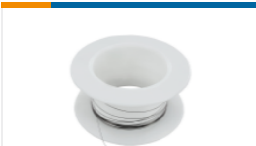
TE Part #R-12167-21 TC,MICRO,BIFILAR,T,44AWG,71.0L, POLYMER