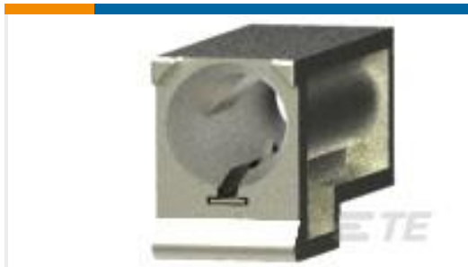
TE Part #1-1469492-2 MULTIGIG RT 9MM GUIDE/ESD 45 DEG