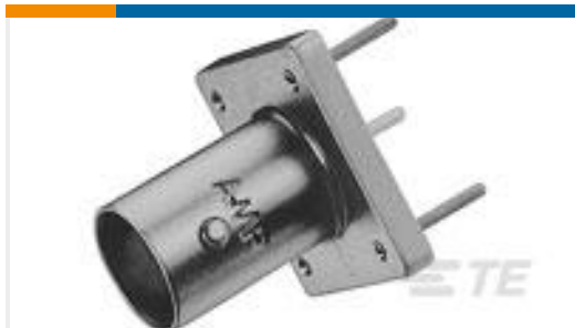
TE Part #5227699-1 BNC PCB VERTICAL