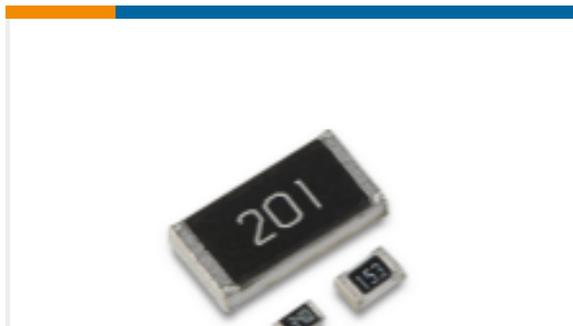
TE Part #2-2176330-1 CRGP 2010 470R 1%