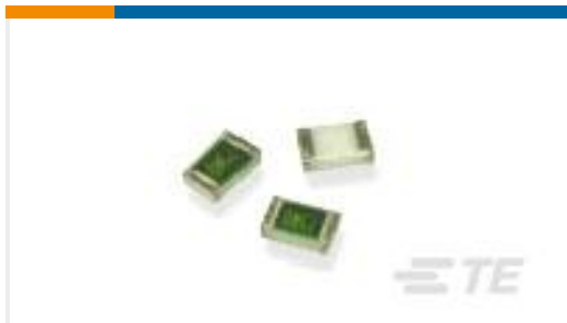
TE Part #5-1879028-3 RN 0805 165K 0.1% 10PPM 1K RL