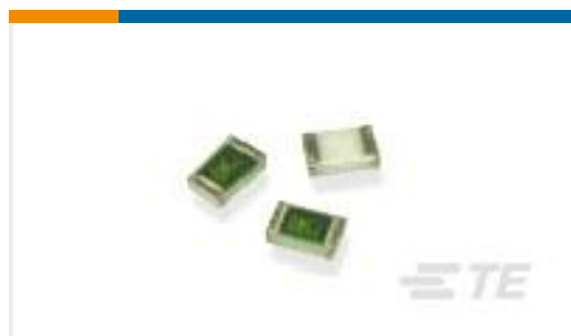
TE Part #7-2176091-0 RP 2A 0.25W 316R 0.1% 25PPM 1K RL