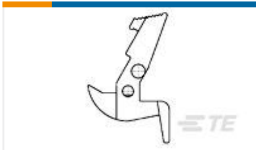
TE Part #102185-1 UNIVERSAL HEADER LATCH