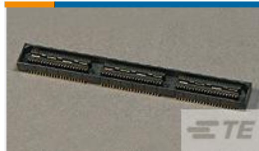
TE Part #1658012-3 MSB0.80RC-ASY120FL,-,10,-TY