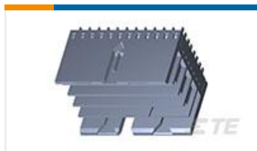
TE Part #2042088-2 Vert.Male, IEC L2