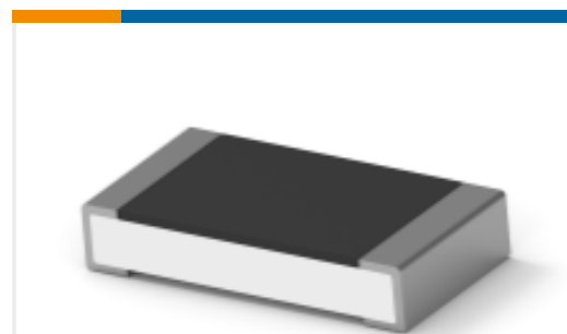
TE Part #1-2176389-4 RQ 1206 147R 0.1% 10PPM 5K RL