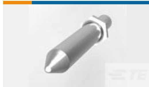
TE Part #223982-1 Stainless Steel Guide Pin M4x0.7