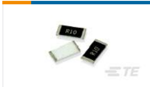
TE Part #2-2176053-0 RLP73N 2A R33 1% 1K RL