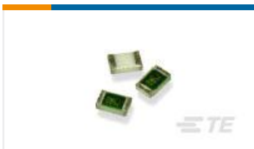
TE Part #8-1879212-4 CPF 0402 17R4 0.1% 25PPM 1K RL