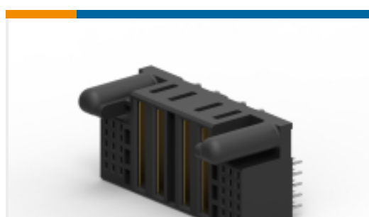
TE Part #2204420-1 MULTI-BEAM HD VERTICAL REC. 15S+2P+2P+15