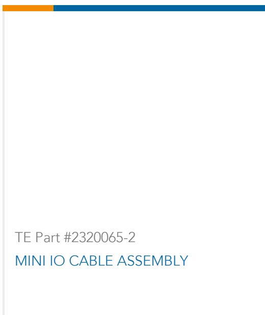
TE Part #2320065-2 MINI IO CABLE ASSEMBLY