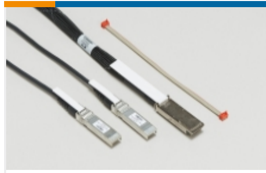
Pluggable I/O Cable Assemblies(81)