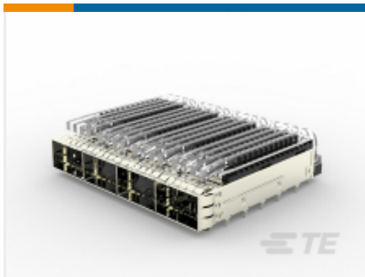
TE Part #2170790-3 CAGE ASSY, 1X4, QSFP28, SPRING, HS, LP