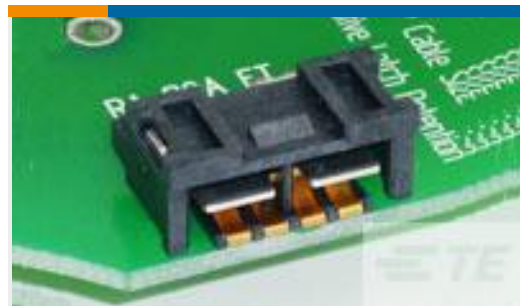
TE Part #1982295-6 ELCON MINI 2P RA HEADER,GOLD,W /O CODING