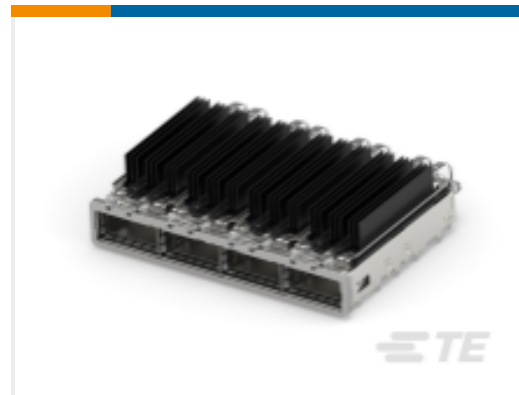
TE Part #2170567-7 1X4 QSFP KIT ASSY W/ LP, CUSTOMERIZED HS