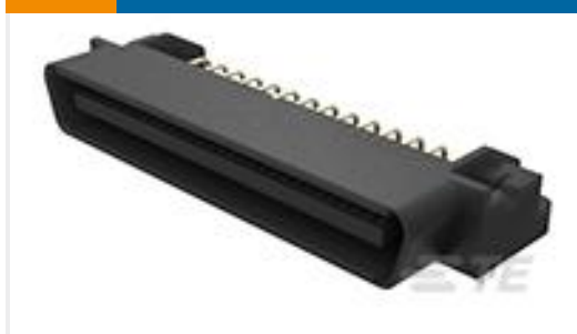
TE Part #1734099-5 Champ 050 series,plug assembly