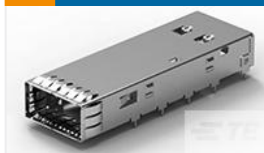
TE Part #2110487-1 QSFP Cage, Solder Leg, No HS Opening