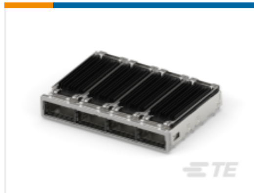
TE Part #2170567-6 1X4 QSFP KIT ASSY, CUSTOMERIZED HS