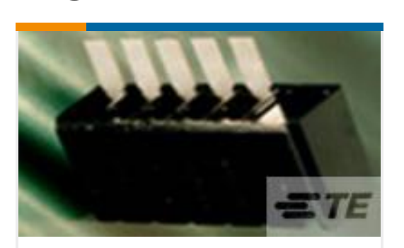
TE Part #146845-1 BATT INT, KEYLESS, 5P, 7.2V