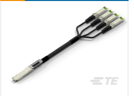
TE Part # CAT-Q17-N490333 QSFP56-Four SFP56 Cable Assembly: 26 AWG