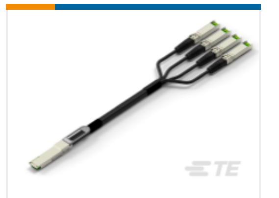
TE Part # CAT-Q17-N49011 QSFP56-Four SFP56 Cable Assembly: 30 AWG