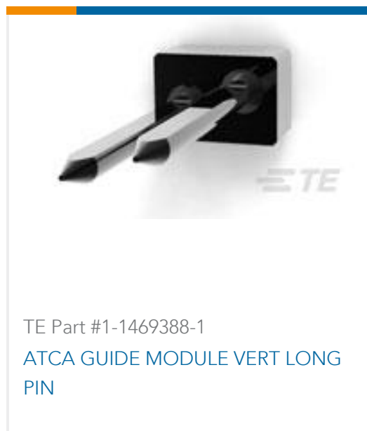
TE Part #1-1469388-1 ATCA GUIDE MODULE VERT LONG PIN