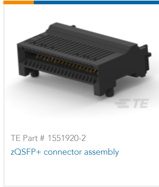
TE Part # 1551920-2 zQSFP+ connector assembly