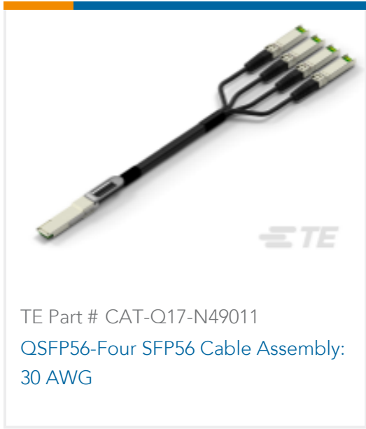
TE Part # CAT-Q17-N49011 QSFP56-Four SFP56 Cable Assembly: 30 AWG