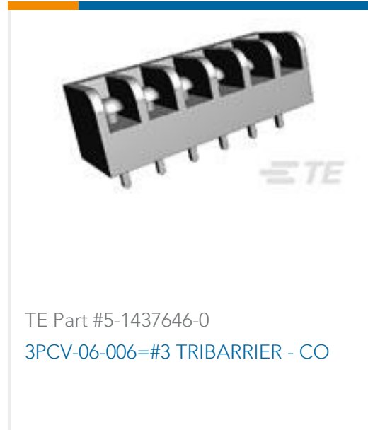
TE Part #5-1437646-0 3PCV-06-006=#3 TRIBARRIER - CO