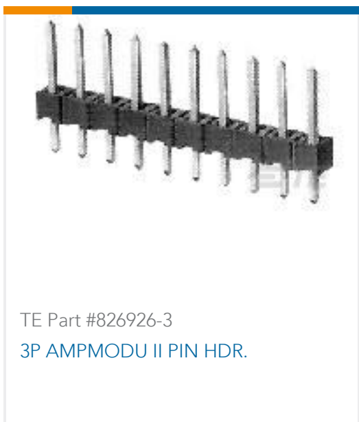
TE Part #826926-3 3P AMPMODU II PIN HDR.