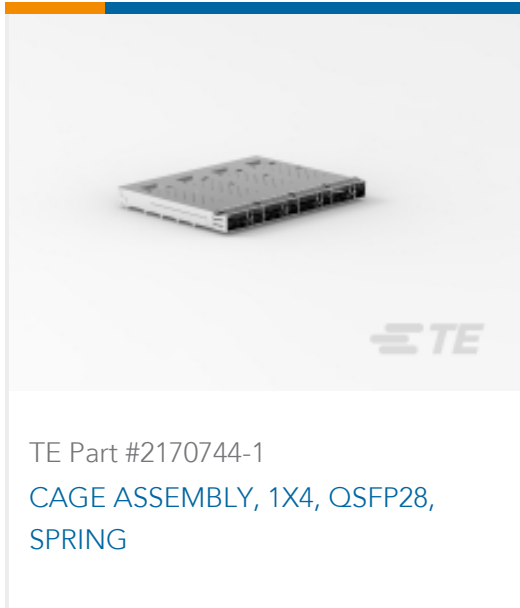
TE Part #2170744-1 CAGE ASSEMBLY, 1X4, QSFP28, SPRING