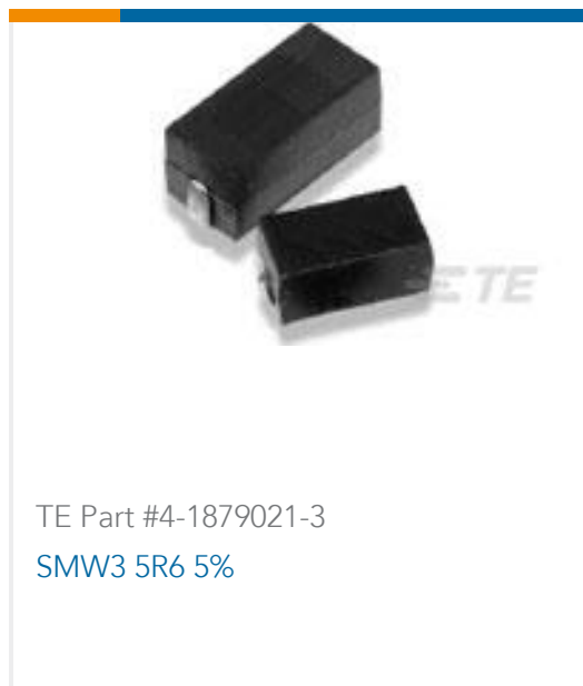
TE Part #4-1879021-3 SMW3 5R6 5%