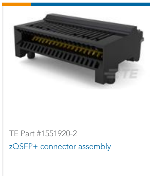
TE Part #1551920-2 zQSFP+ connector assembly