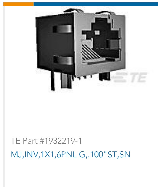
TE Part #1932219-1 MJ,INV,1X1,6PNL G.,.100"ST,SN