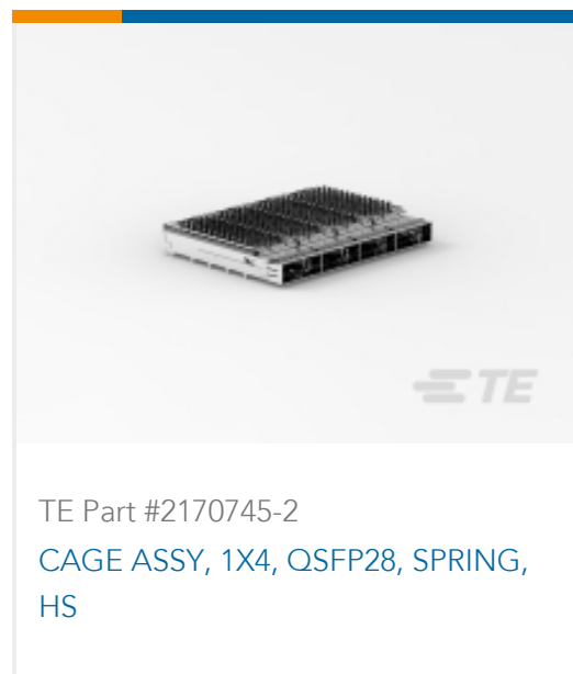
TE Part #2170745-2 CAGE ASSY, 1X4, QSFP28, SPRING, HS