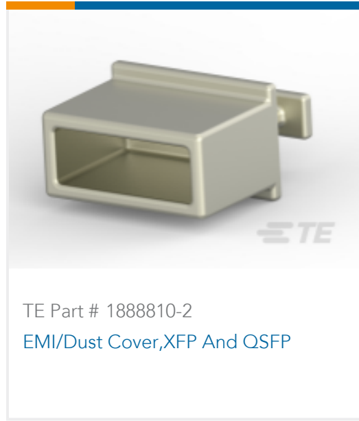
TE Part # 1888810-2 EMI/Dust Cover,XFP And QSFP