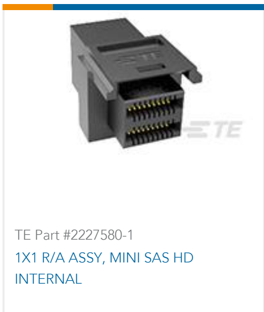
TE Part #2227580-1 1X1 R/A ASSY, MINI SAS HD INTERNAL