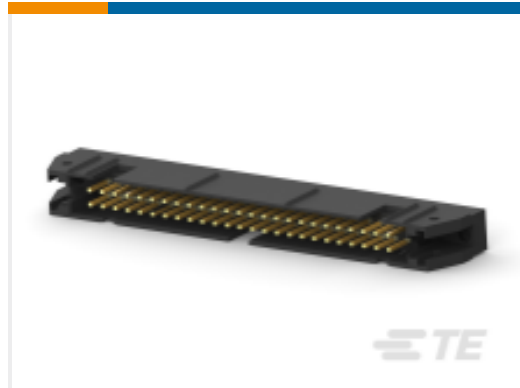
TE Part #1-5499922-0 AMP-LATCH UNIVERSAL HEADERS