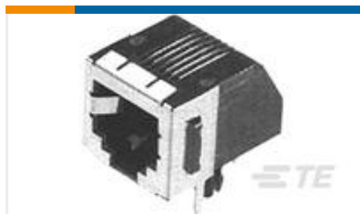
TE Part #5555140-1 MJ,LPF,R/A,6P/6C,SHLD,PNL GRD