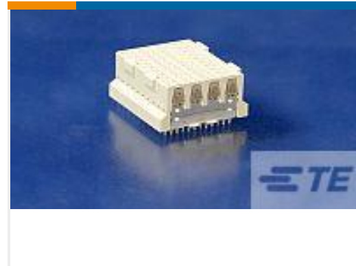
TE Part #1469362-1 HM-ZD VERT RECPT ASSY 18MM