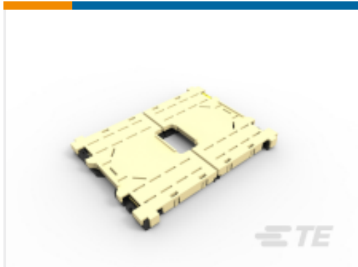
TE Part #2-2822979-3 LGA3647-0 SOCKET P0 KIT FOR ODM (30U AU)