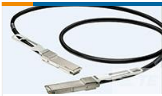
TE Part # 2829040-2 QSFP IB EDR, 33AWG, 1.0M