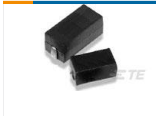
TE Part #4-1879021-3 SMW3 5R6 5%