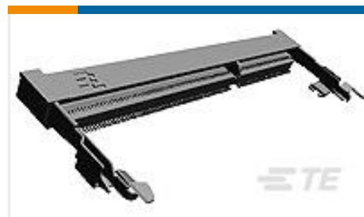
TE Part #2013290-1 SEMI-HARD TRAY DDR3 204P 5.2H RVS