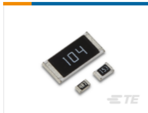
TE Part #3-2176339-7 CRGCQ 0603 10K 1%