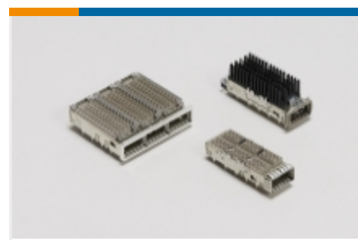
QSFP, QSFP+ &amp; zQSFP+(425)