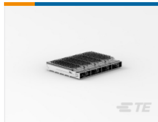
TE Part #2170745-2 CAGE ASSY, 1X4, QSFP28, SPRING, HS