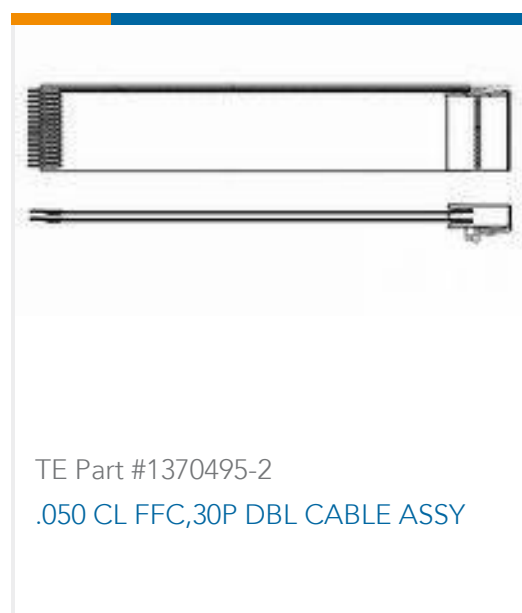
TE Part #1370495-2 .050 CL FFC,30P DBL CABLE ASSY