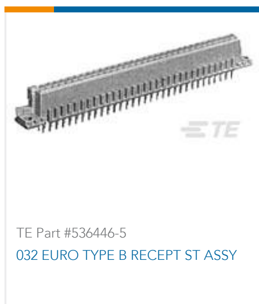
TE Part #536446-5 032 EURO TYPE B RECEPT ST ASSY