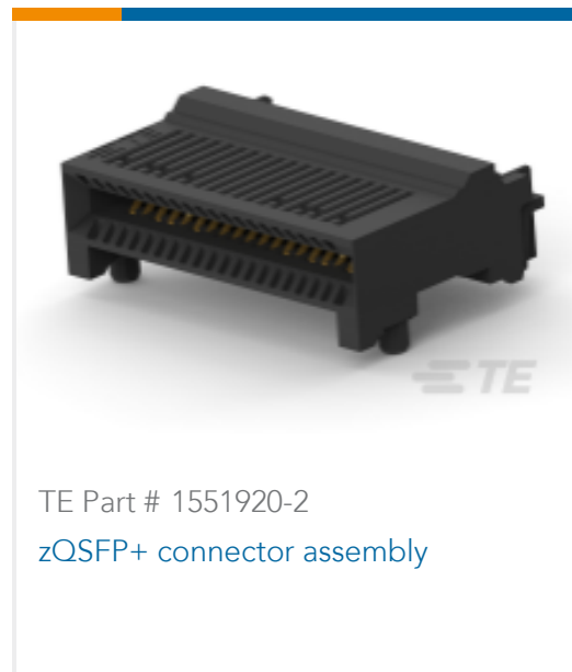
TE Part # 1551920-2 zQSFP+ connector assembly