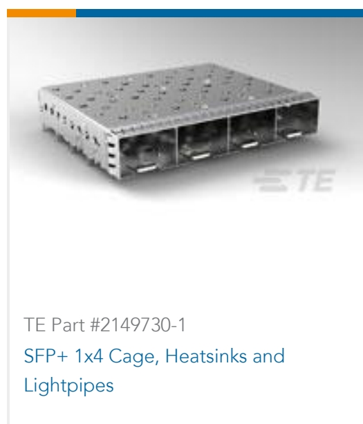
TE Part #2149730-1 SFP+ 1x4 Cage, Heatsinks and Lightpipes