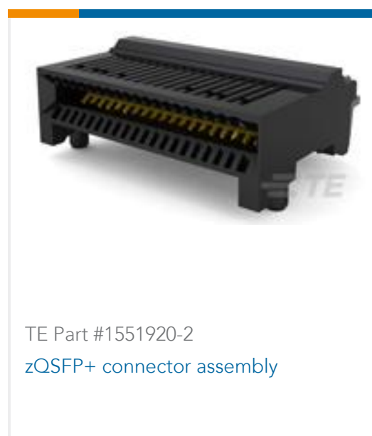
TE Part #1551920-2 zQSFP+ connector assembly