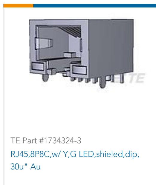
TE Part #1734324-3 RJ45,8P8C,w/ Y,G LED,shieled,dip, 30u" Au