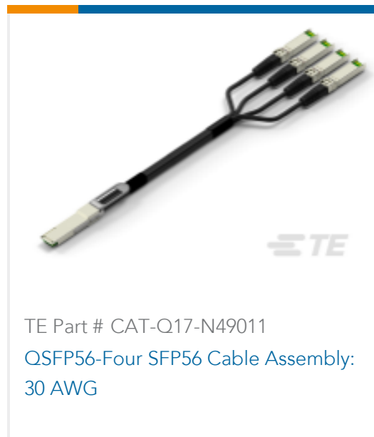
TE Part # CAT-Q17-N49011 QSFP56-Four SFP56 Cable Assembly: 30 AWG