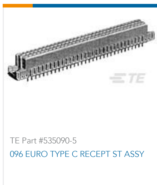
TE Part #535090-5 096 EURO TYPE C RECEPT ST ASSY