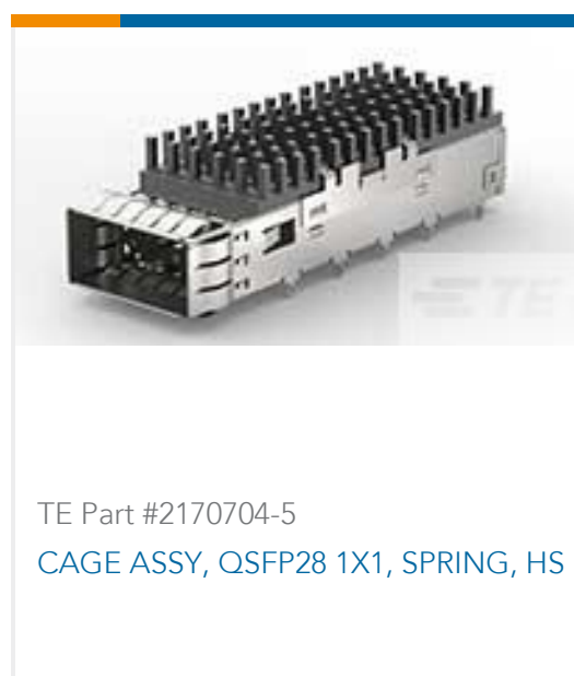
TE Part #2170704-5 CAGE ASSY, QSFP28 1X1, SPRING, HS