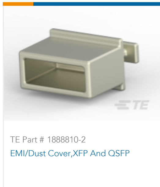
TE Part # 1888810-2 EMI/Dust Cover,XFP And QSFP