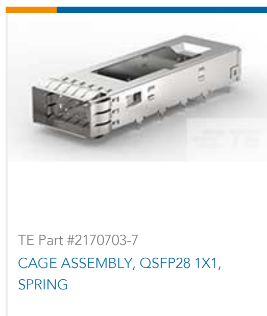
TE Part #2170703-7 CAGE ASSEMBLY, QSFP28 1X1, SPRING