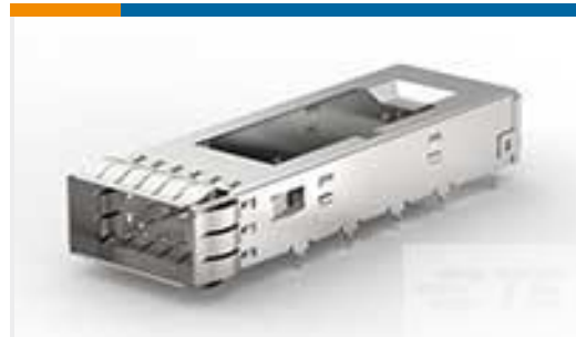
TE Part #2170703-7 CAGE ASSEMBLY, QSFP28 1X1, SPRING