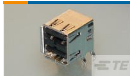
TE Part #5787617-1 RECP ASSY, R/A, STACKED, THRU-HOLE, USB,