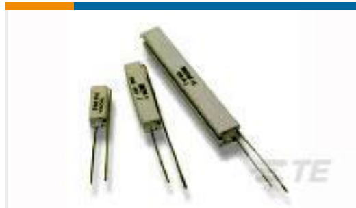
TE Part #1623727-2 SBCH 7 22R 5%