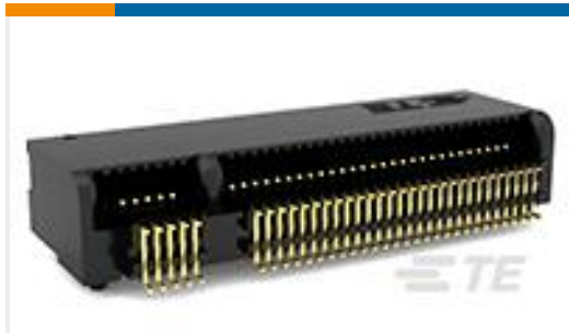
TE Part #1-2199230-6 M.2 0.5PITCH 4.2H KEY M 30U AU