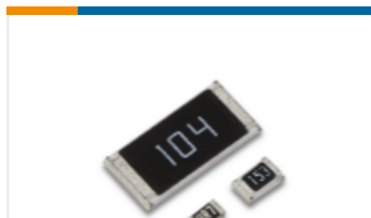
TE Part #1-2176339-6 CRGCO 0603 180R 1%