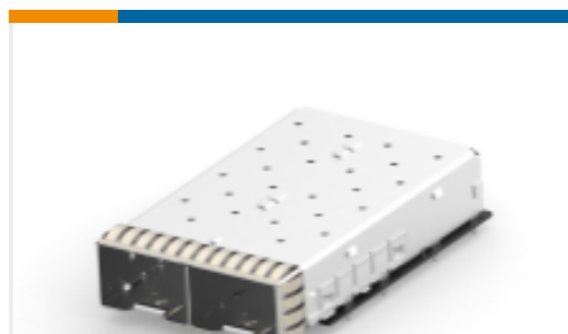
TE Part #2317010-1 ZSFP+ 1X2 CAGE BELLY TO BELLY