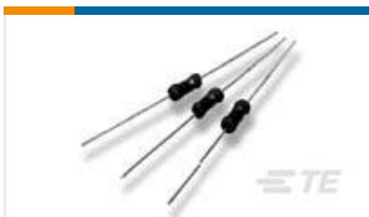
TE Part #3-1879355-4 RR03 5% 100K AMMO