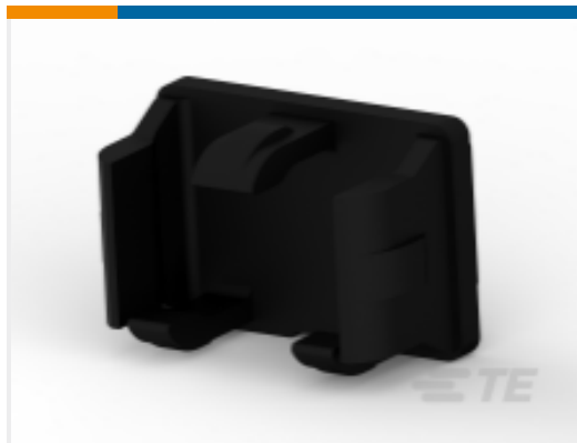
TE Part # 1367147-3 SFP COVER, UNPL, NO LOGO