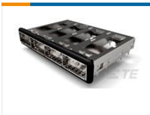
TE Part #2170288-1 1X4 CAGE ASSEMBLY, THRU BEZEL, QSFP