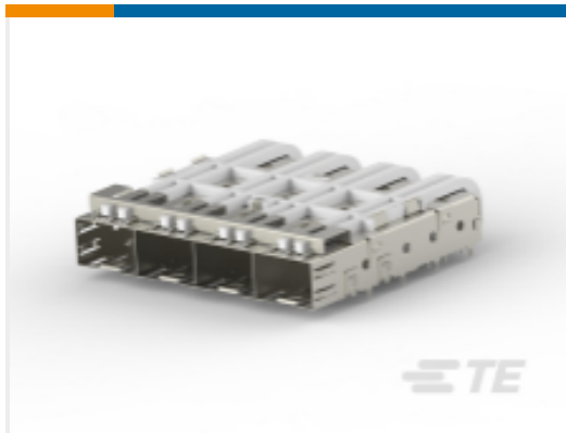
TE Part #1761008-3 SFP 1X4 CAGE & LIGHT PIPE KIT