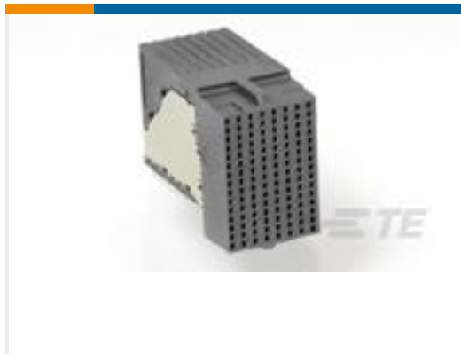
TE Part #1934229-1 Tin Man Recept Assy 3 Pair16 Column