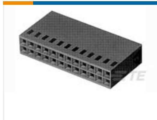
TE Part #87456-6 10 MODIV HSG DR MRKD .100CL