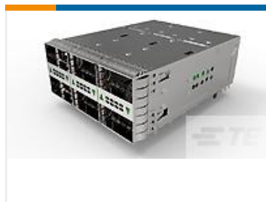
TE Part #2227671-2 zQSFP+ STACKED RECEPTACLE ASSEMBLY 2X3