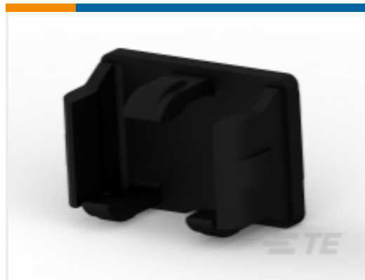
TE Part # 1367147-1 SFP COVER, UNPLATED