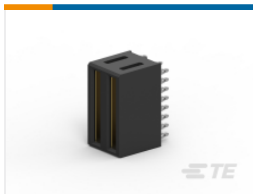
TE Part #2204423-1 MULTI-BEAM HD VERTICAL REC. 2P