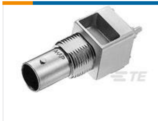
TE Part #5222132-1 JACK,VERTICAL,PCB,75 OHM,BNC