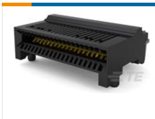
TE Part #1551920-2 zQSFP+ connector assembly