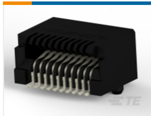
TE Part # CAT-SF59-C76264 SFP Connectors