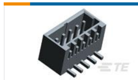
TE Part #5-1775443-2 EMIX CONN., 1.5MM PITCH, HDR, V/T, 2P