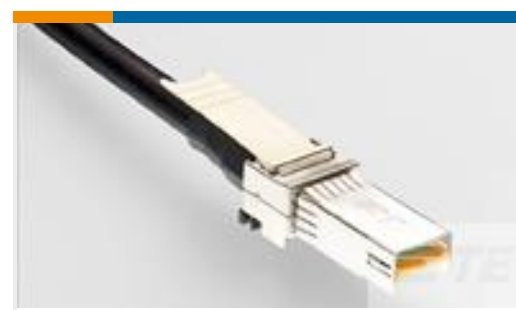
TE Part # 2142970-4 CABLE ASSY, MICRO SFP+ TO STD SFP+, 3M