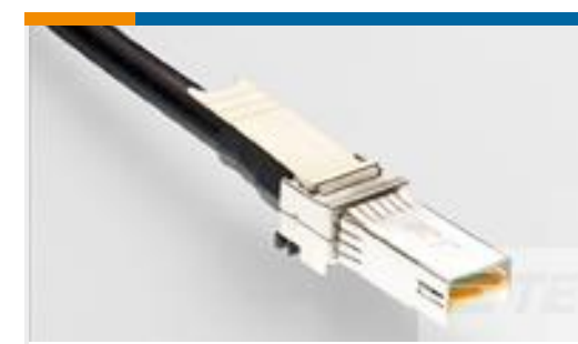
TE Part # 2142970-5 CABLE ASSY, MICRO SFP+ TO STD SFP+, 4M