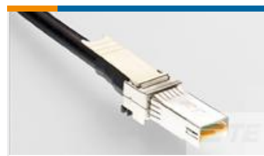
TE Part # 2142970-3 CABLE ASSY, MICRO SFP+ TO STD SFP+, 2M