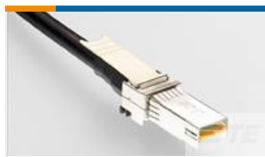
TE Part # 2142970-2 CABLE ASSY, MICRO SFP+ TO STD SFP+, 1M