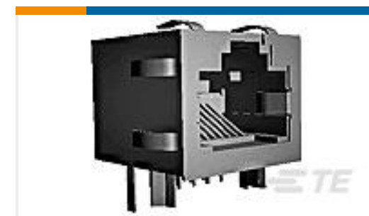
TE Part #1-406541-1 MJ, INV, 1X1, 6PNL G., 100" ST, SN