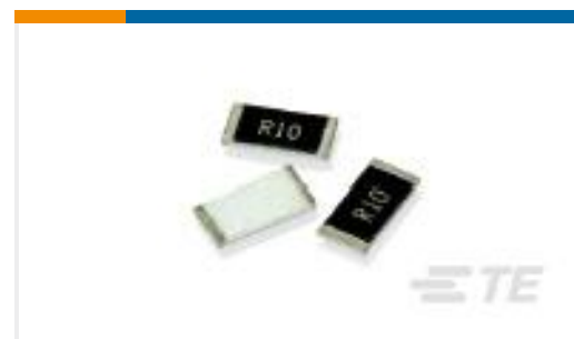
TE Part #1622825-1 RL73K 2A R10 5% 5K RL