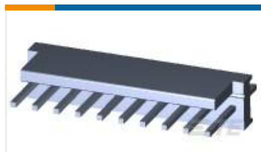
TE Part #1-640454-0 10P MTA100 HDR ASSY SQ STR POL