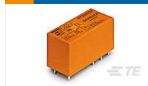
TE Part #1-1393243-9 RTE25005