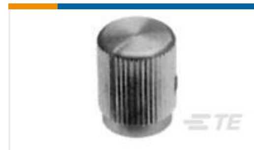
TE Part #1437622-7 KLN900B1/4=KNOB KNURL W/IND LI