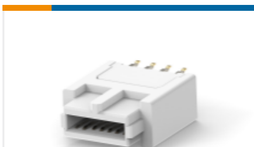
TE Part #1-2271452-4 14 PIN BTB CONNECTOR, REC HDR ASSEMBLY