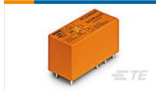
TE Part #1649329-4 RTE24012