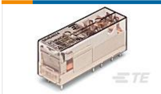
TE Part #9-1415053-1 SR4M4018