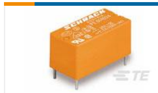
TE Part #1393219-6 PE014012