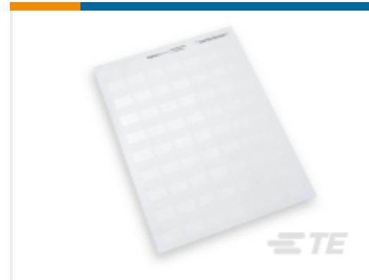
TE Part #9-1768016-7 CSL-14033P-9