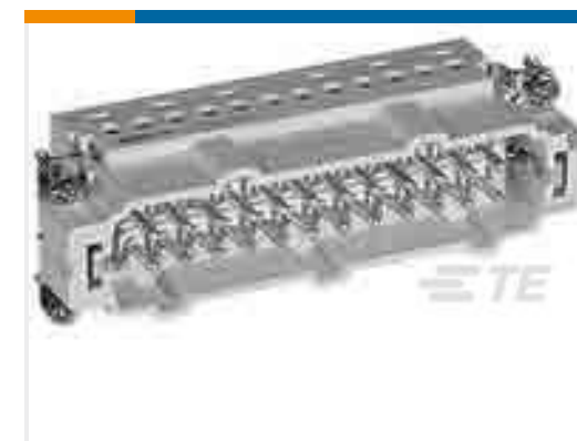
TE Part #1-1103640-8 HE24STI S-T.B12+6+6