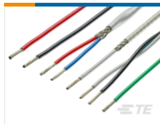
TE Part #E855433001 99M0111-20-2CK0001