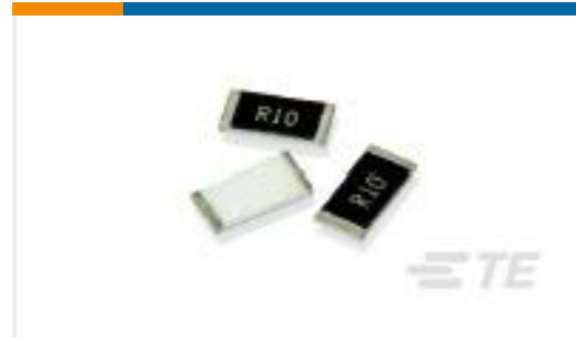
TE Part #4-2176056-9 RLP73K 2B 1R0 5% 5K RL