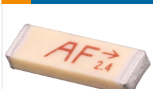
TE Part #L9000014-01 Antenna Chip T&R 2.45GHz SMT