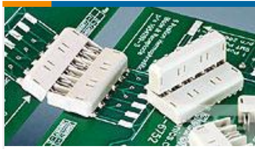
TE Part #1954289-3 Connector, Blade & Recept 6 Pos