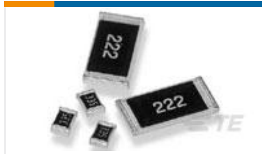
TE Part #1622826-4 CRG0402 5% 10K