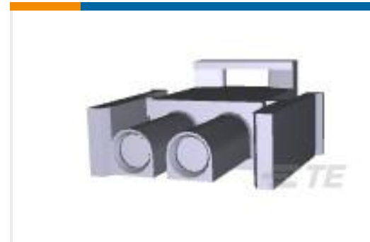
TE Part #350777-4 02P UMNL PLUG HSG UL94V0