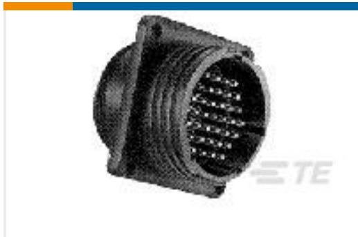
TE Part #206705-3 CPC RECPT ASSEMBLY SIZE 13-9