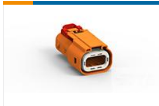
TE Part #4-2103015-5 PLUG SUBASSY, E, HVA280-2PHM F