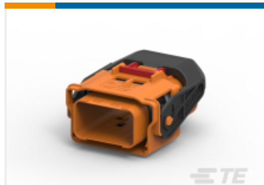
TE Part #2141608-4 5POS, AMP MCP6.3/4.8K, REC HSG, A