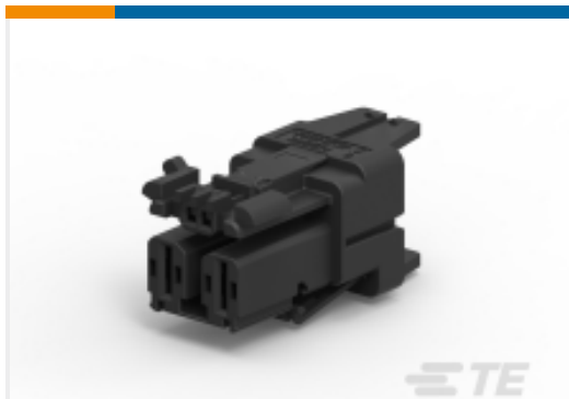
TE Part #2141259-1 2POS, MIXED, REC HSG, ASSY