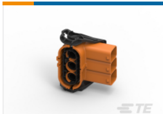
TE Part #1-2141166-1 3POS, 8MM HV, REC HSG, 90DEG, ASSY, SEALED