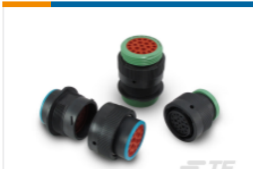
TE Part #HDP26-24-21PE DEUTSCH HDP20 Housings