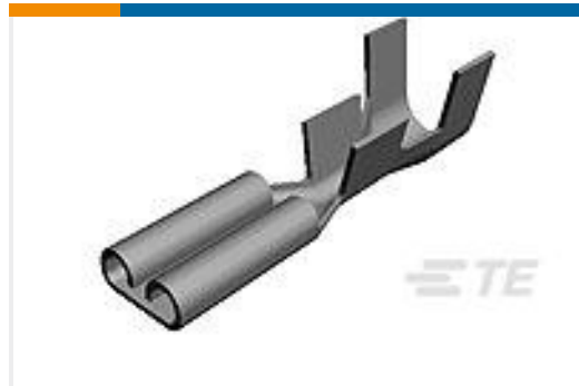
TE Part #42579-1 250 FASTON REC 16-12 AWG NPST