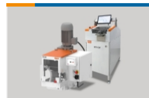
High Voltage Wire Processing Equipment(10)