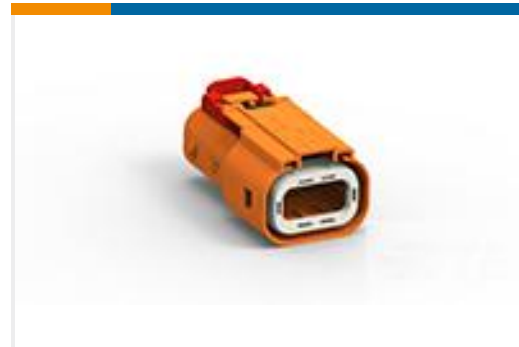
TE Part #4-2103015-1 PLUG SUBASSY, A, HVA280-2PHM F