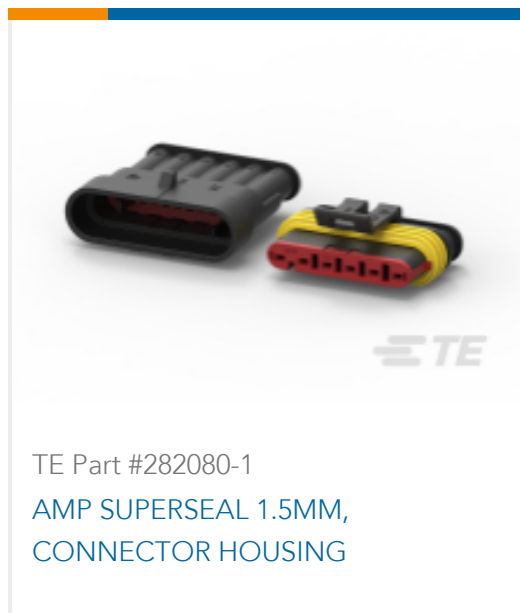
TE Part #282080-1 AMP SUPERSEAL 1.5MM, CONNECTOR HOUSING