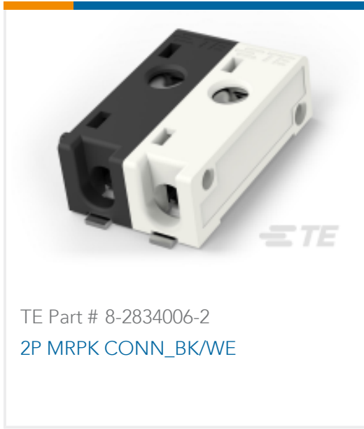
TE Part # 8-2834006-2 2P MRPK CONN_BK/WE