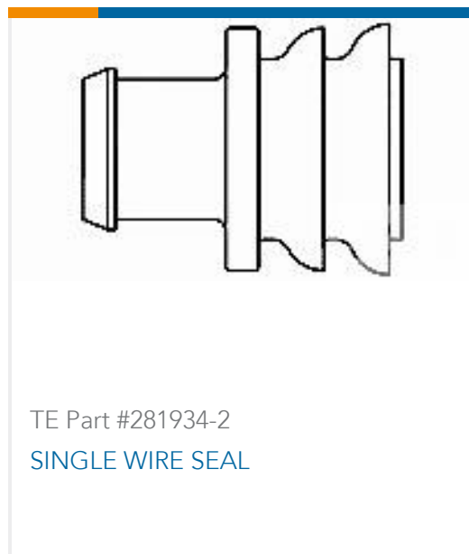
TE Part #281934-2 SINGLE WIRE SEAL