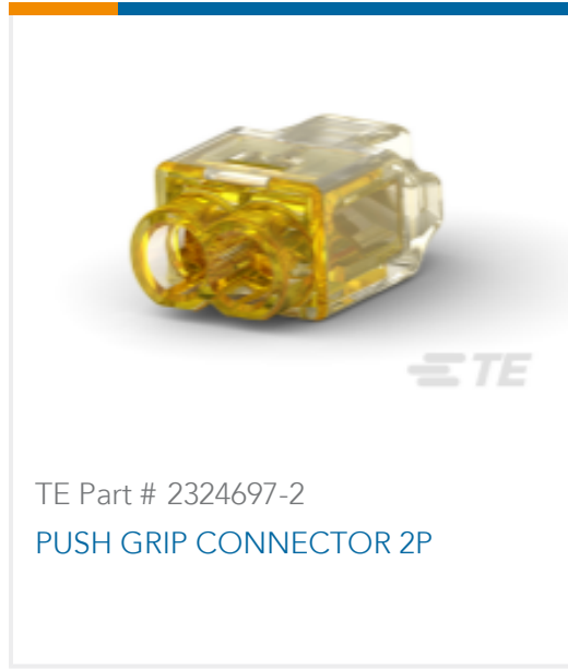
TE Part # 2324697-2 PUSH GRIP CONNECTOR 2P