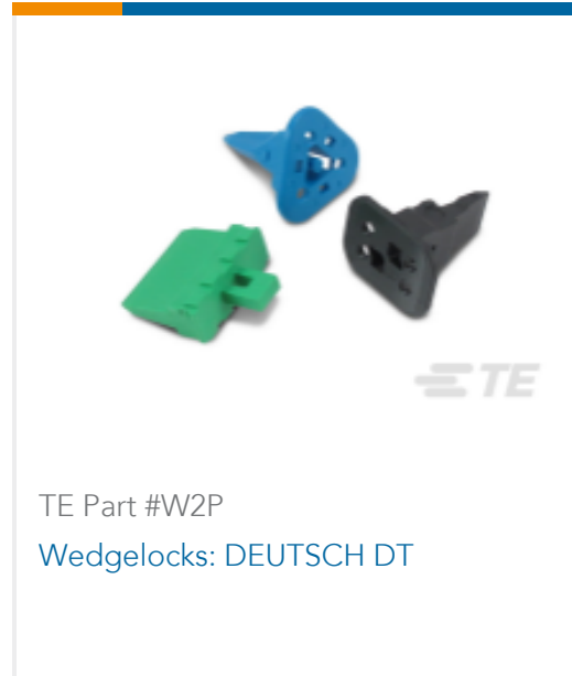
TE Part #W2P Wedgelocks: DEUTSCH DT