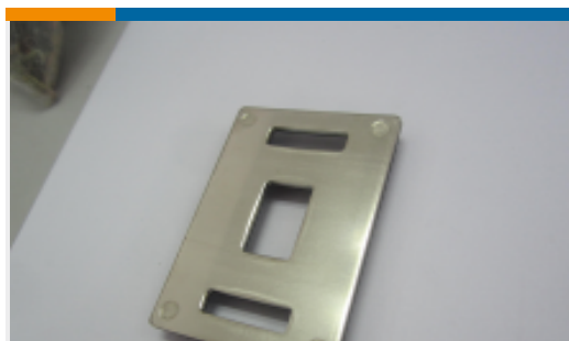
TE Part #2134440-3 BP ASSY, LGA2011,9MM STUD