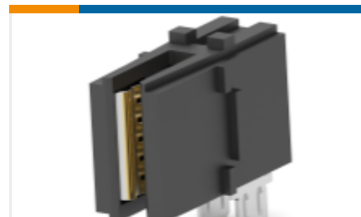
TE Part #2178531-4 Crown Clip Junior AG Plating Reflow