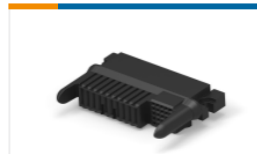
TE Part #8-1926739-3 ASSYMINIPAK HDL25S10PRARECPTSC