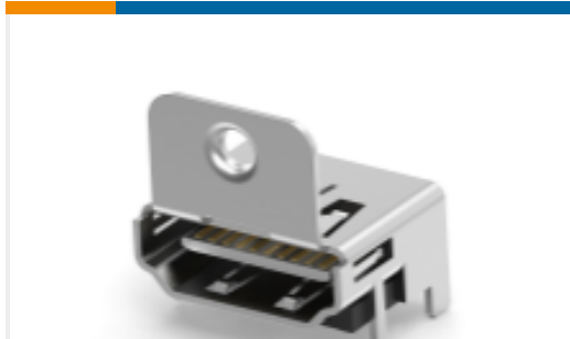
TE Part #1-1747981-9 TRAY PACKAGE HDMI CONNECTOR SMT