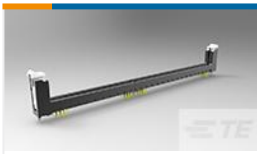
TE Part #1-1932680-1 VLP DDR3 DIMM 240POS. 1.0PITCH