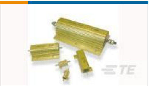
TE Part #1630024-1 HSC250 100R 5%