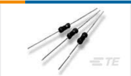
TE Part #3-1879353-1 RR02 5% 75K AMMO