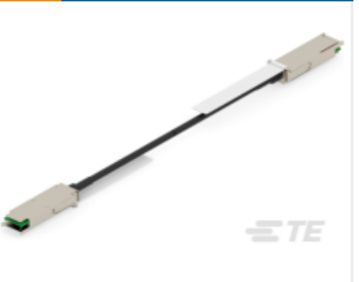
TE Part # CAT-C11-H5011142 QSFP to QSFP I/O Cable Assembly: 33 AWG