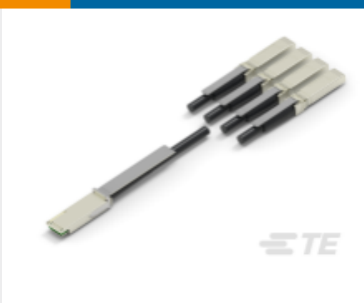
TE Part # CAT-C11-H5011 QSFP-Four SFP+ I/O Cable Assembly 28 AWG