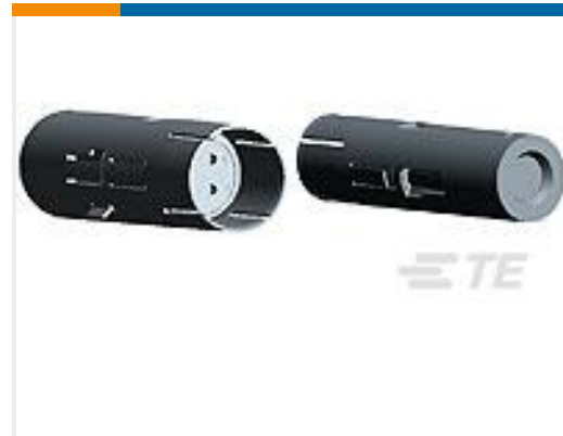
TE Part #1103426-1 MALE INSERT, CRIMP, 4-POS. 22DF CONTACTS