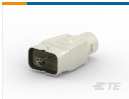
TE Part #2120457-1 HOOD KIT MOTORMAN HC 180 METAL