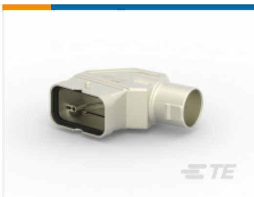
TE Part #2120330-1 METAL HOOD / KIT