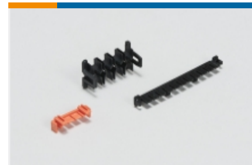
Rectangular Connector Locking(2)