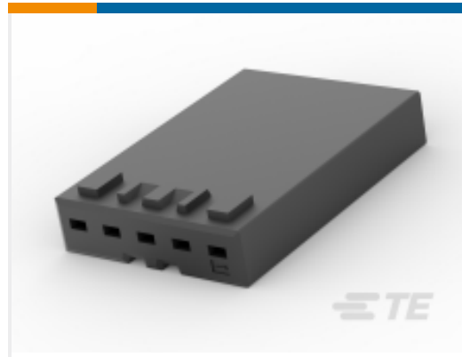
TE Part #2295894-1 SIGNAL HOUSING