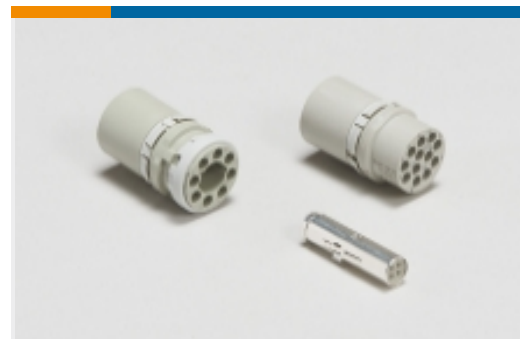
Circular Connector Contact Inserts(2)