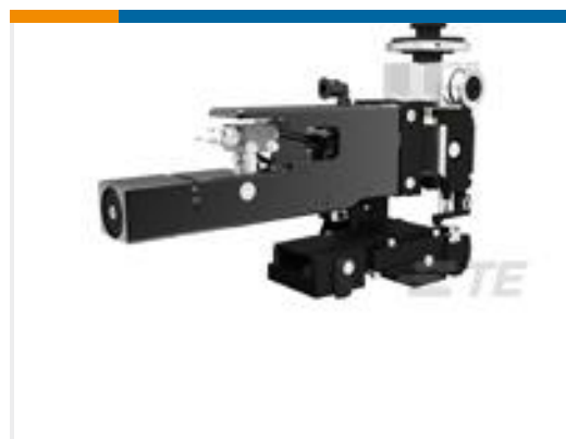
TE Part #2151338-2 OCEAN-2.0-APPLICATOR-S- 140F140O2100