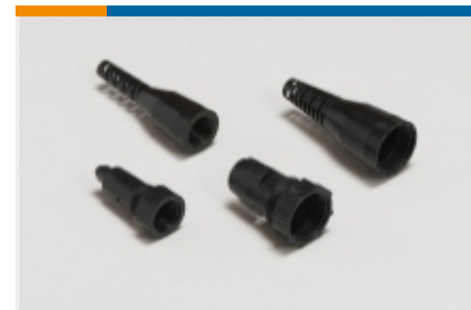
Connector Strain Relief(3)