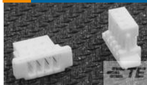
TE Part #1-1470364-0 1.0MM W T B RECPT,10POSHOUSING