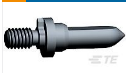
TE Part #2000676-7 Keyed Guide Pin, Machined