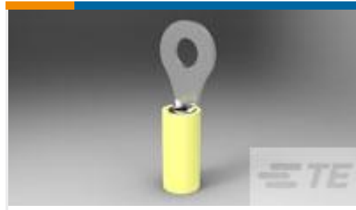
TE Part #8-323915-1 TERMINAL,PIDG R 26-22 6