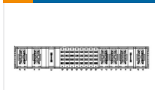
TE Part #2309390-2 VERT RECPT, MULTI-BEAM XLE, VITA 62