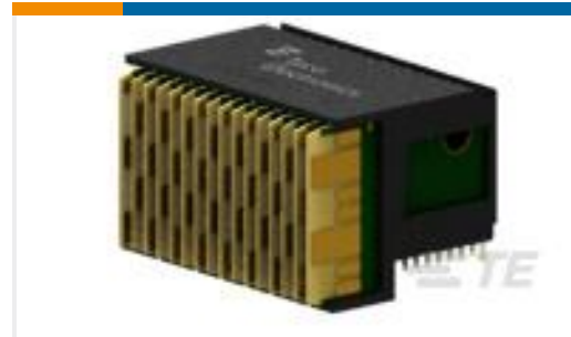
TE Part #1410188-3 MULTIGIG RT T2 7RW DC DF F-RGT