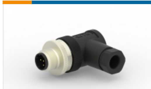
TE Part #T4113501051-000 M12,MALE,RA,D CODE,5P,PG7,GOLD