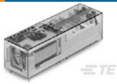
TE Part #1415015-1 SR6A4024 - V23050-A1024-A533