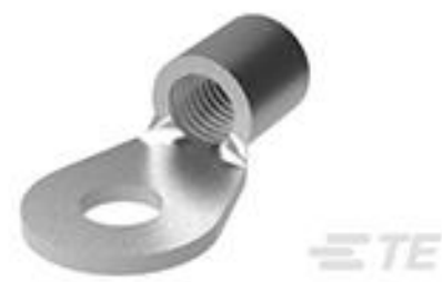
TE Part #33465 TERMINAL, SOLIS R 6 1/4