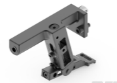
TE Part #2119580-1 MECHANICAL FEED ASSEMBLY