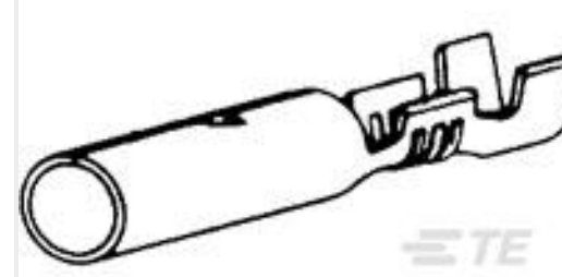
TE Part #60799-5 SHUR PLUG 180 RECEPTACLE 18-14 AWG TPBR