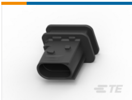
TE Part #2112299-1 PROTECTION CAP, FOR REC.HSG GR