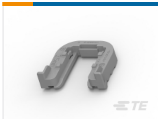
TE Part #1703810-6 SLIDE,TAB HSG GROUP B