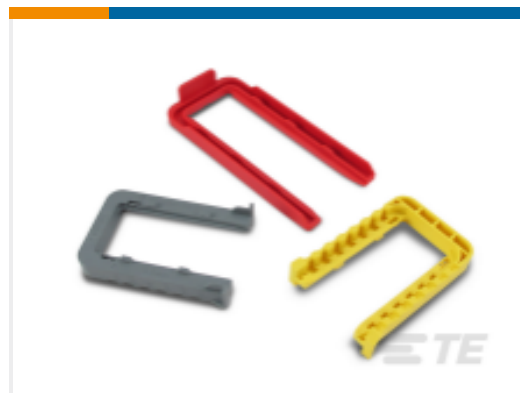
TE Part #2112045-1 LEAVYSEAL Locking Slides