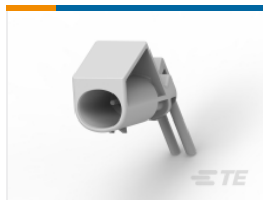
TE Part #1337213-3 E1 DIRECT DIESEL INJ CONN