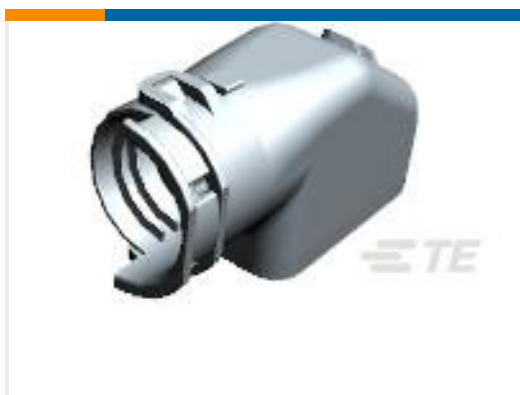
TE Part #2112167-1 COVER,90,FOR 21POS.