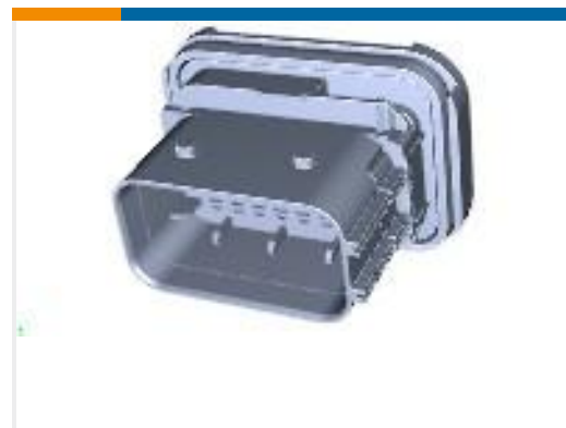
TE Part #1-2112162-1 21POS,TAB 2.8X0.8,TAB HSG,SEALED ASSY