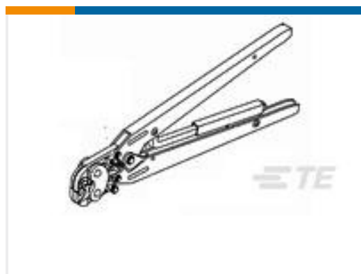
TE Part #180319 DAHT FLAG FASTON/FASTIN-ON 18-14 ASSY