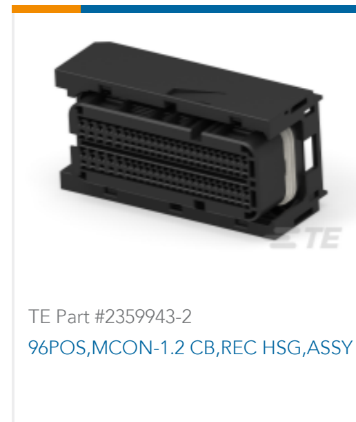
TE Part #2359943-2 96POS,MCON-1.2 CB,REC HSG,ASSY