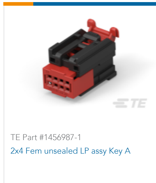
TE Part #1456987-1 2x4 Fem unsealed LP assy Key A