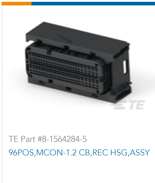
TE Part #8-1564284-5 96POS,MCON-1.2 CB,REC HSG,ASSY