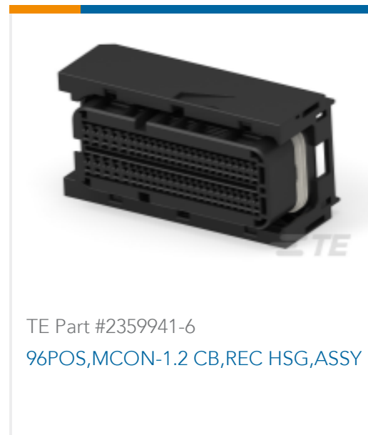
TE Part #2359941-6 96POS,MCON-1.2 CB,REC HSG,ASSY