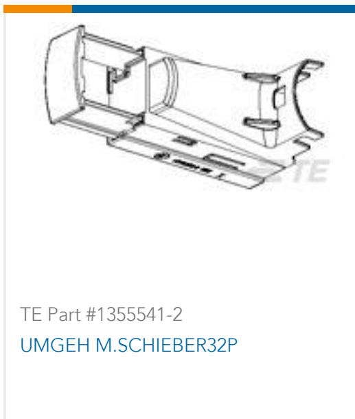
TE Part #1355541-2 UMGEH M.SCHIEBER32P