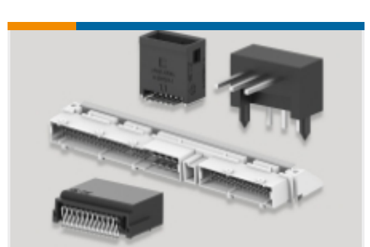
PCB Headers & Receptacles(1)