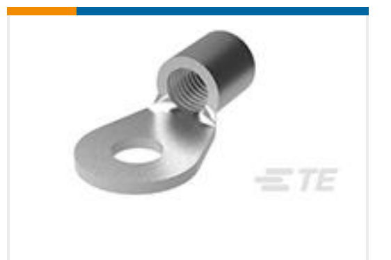
TE Part #35184 TERMINAL, SOLIS R 2 3/8