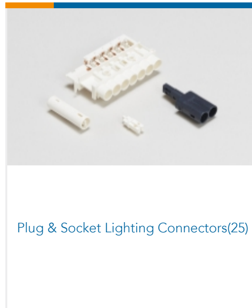
Plug & Socket Lighting Connectors(25)