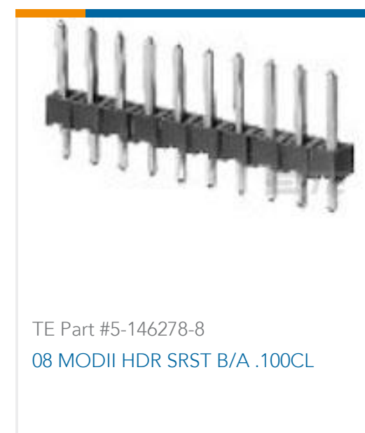
TE Part #5-146278-8 08 MODII HDR SRST B/A .100CL