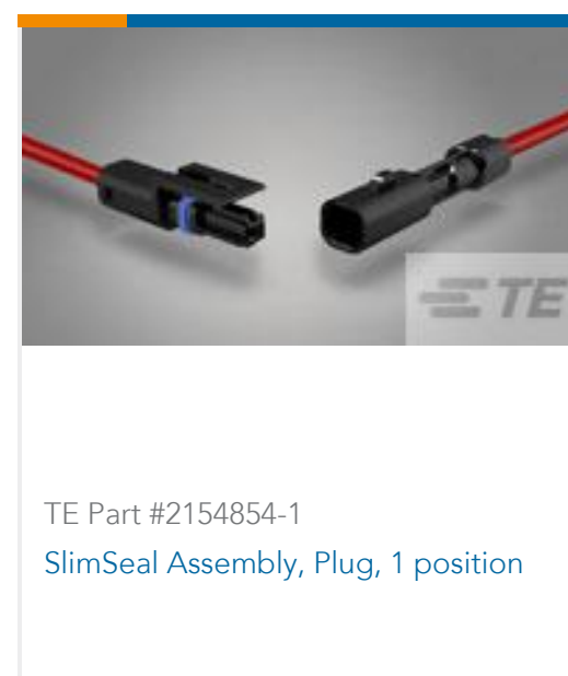
TE Part #2154854-1 SlimSeal Assembly, Plug, 1 position