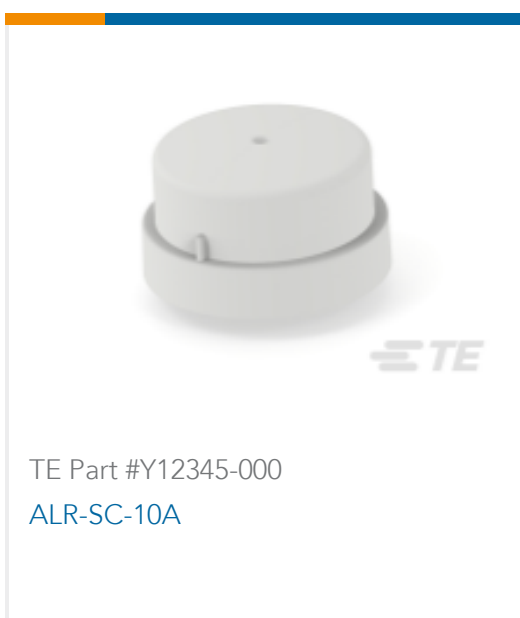
TE Part #Y12345-000 ALR-SC-10A