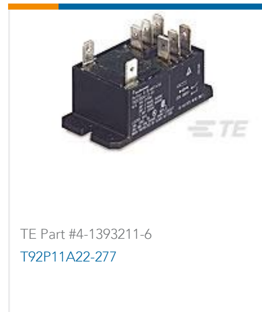
TE Part #4-1393211-6 T92P11A22-277