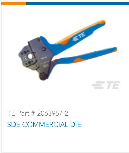
TE Part # 2063957-2 SDE COMMERCIAL DIE