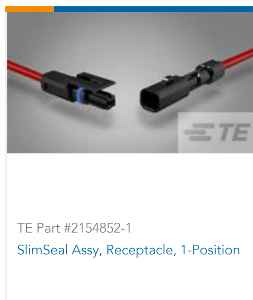
TE Part #2154852-1 SlimSeal Assy, Receptacle, 1-Position