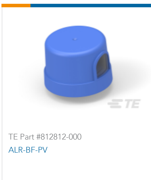
TE Part #812812-000 ALR-BF-PV