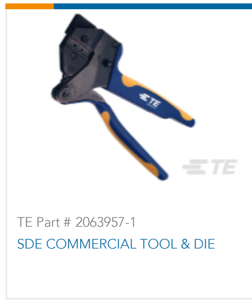
TE Part # 2063957-1 SDE COMMERCIAL TOOL & DIE