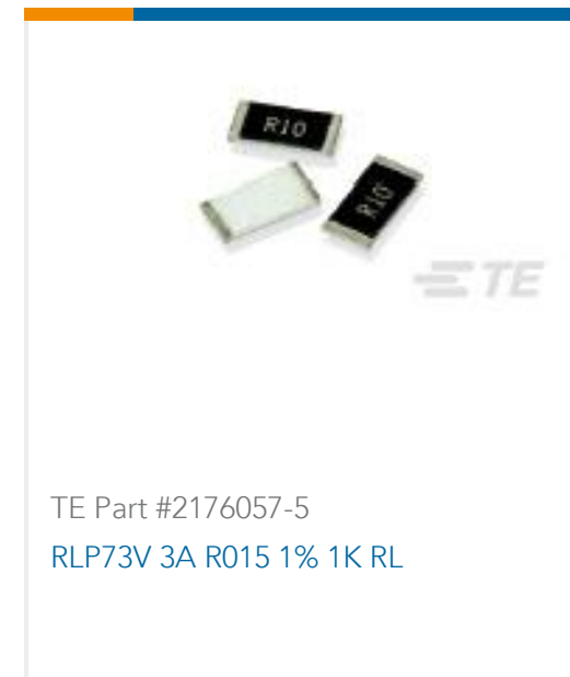
TE Part #2176057-5 RLP73V 3A R015 1% 1K RL