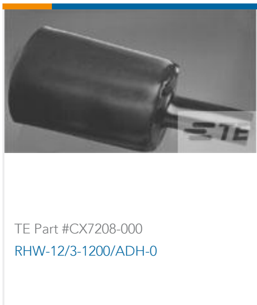
TE Part #CX7208-000 RHW-12/3-1200/ADH-0