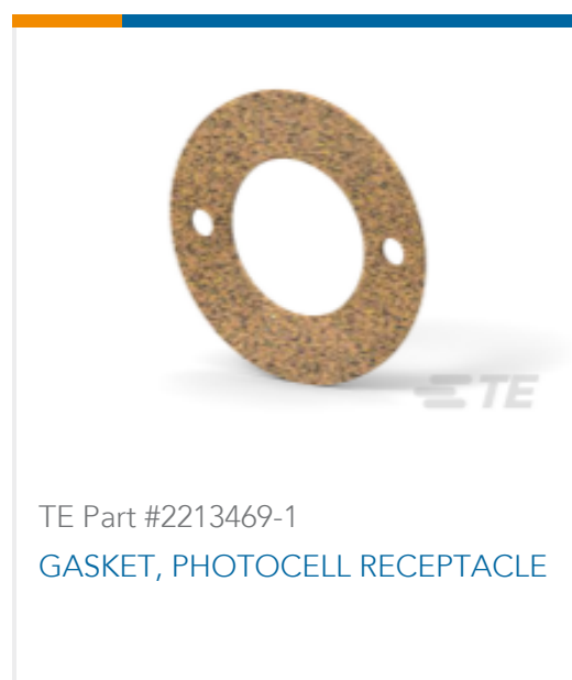
TE Part #2213469-1 GASKET, PHOTOCCELL RECEPTACLE