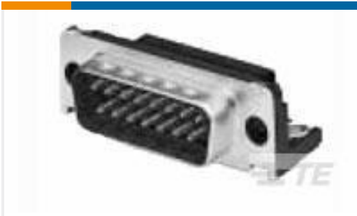
TE Part #5747841-2 15 MSFL PLUG RA 318 (FM,BL)