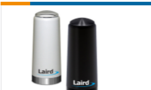
TE Part #TRA6927M3PBN-001 OMNI,Ph,PMT,698/1710MHz BK,, 100W,NGP