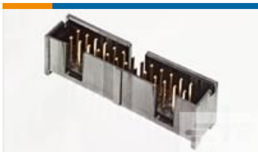
TE Part #5103308-1 A/L LOW PRO HDR 10P VERT BLACK