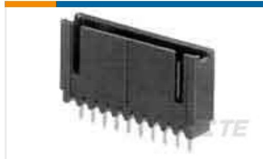
TE Part #5-102202-3 06 MODII HDR SRST SHRD LF