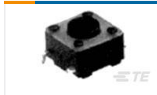
TE Part #4-1437565-2 FSM4JSMATR=TACT SWITCH 6X6MIL