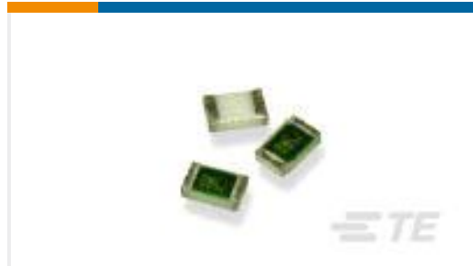
TE Part #8-1879215-5 CPF 0402 34K8 0.1% 25PPM 1K RL