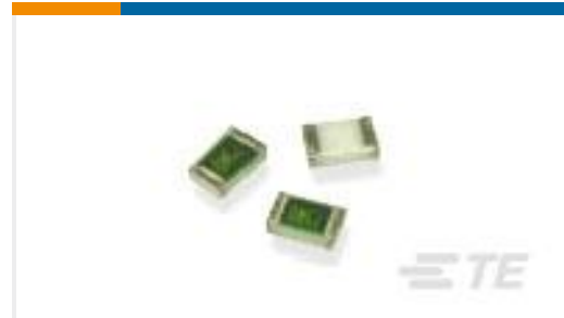
TE Part #8-2176091-6 RP 2A 0.25W 464R 0.1% 25PPM 1K RL