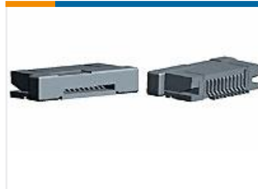
TE Part #3-1734592-1 FPC CONN. 0.5MM PITCH B/C, 31P