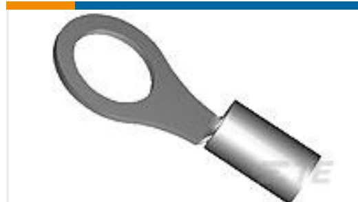
TE Part #31113 TERMINAL,BUDG R 12-10 8