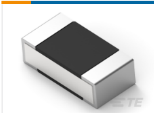
TE Part #2-2176307-1 RP 1E 0.1W 20K 0.1% 25PPM 5K RL