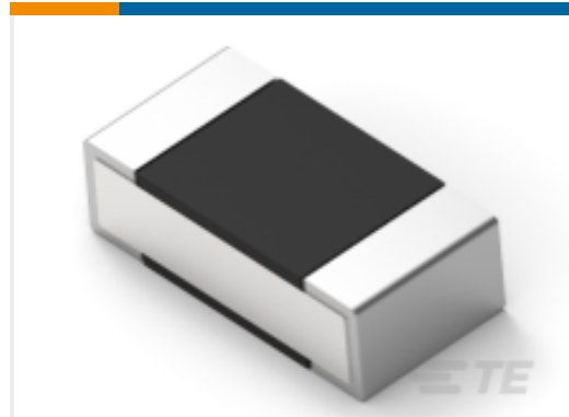
TE Part #4-2176307-8 RP 1E 0.1W 38K3 0.1% 25PPM 5K RL