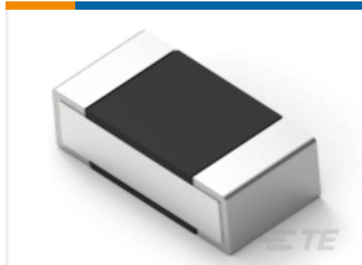
TE Part #2-2176306-4 RP 1E 0.1W 2K0 0.1% 25PPM 5K RL