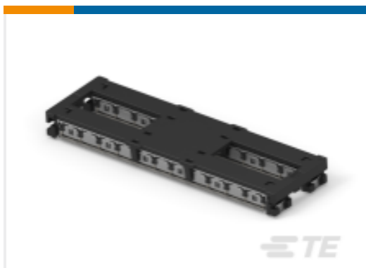
TE Part #2369316-1 16G 05FH 5H plug aassy 440POS 8u* Au