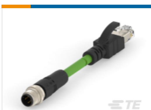
TE Part #TCD14741111-002 M12D4-MS-RJ-PVC-22SH-TYPE B GREEN-1.0M