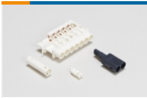
Plug &amp; Socket Lighting Connectors(33)