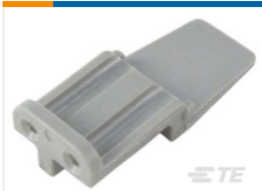
TE Part #WM-2SA WEDGE LOCK, 2P, PLG, GRY, DTM, A