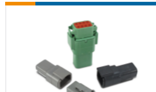
TE Part #DTM04-2P-E007 DEUTSCH DTM Housings