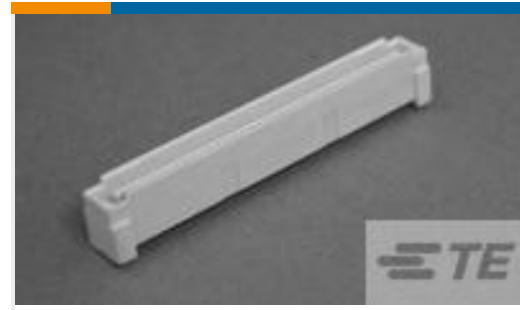
TE Part #5179031-3 0.8FH,P08H.5,080,08/Sn,TU