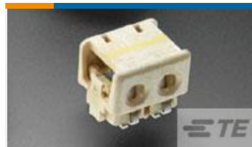
TE Part #1-2106003-1 Connector, SMT-IDC, 1 POS, 20 AWG