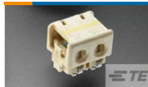
TE Part #2106003-2 Connector, SMT-IDC, 2 position, 18AWG