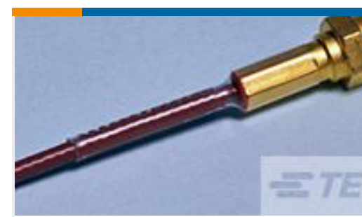
TE Part #CV4354-000 HT-200-3/64-X-SP