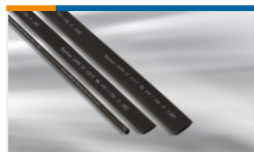
TE Part #EM7479-000 X2-1.0-0-SP-SM