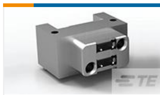
TE Part #2000974-1 Connector Kit, Plug, Module Card, MT, V66.1