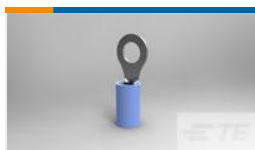
TE Part #2-320574-2 TERMINAL,PIDG R 16-14 10