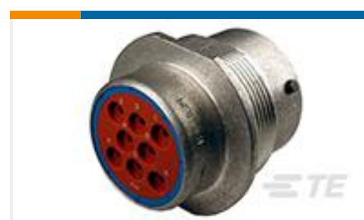
TE Part #HD34-18-8PE REC, 8P, AL, E, 12, P