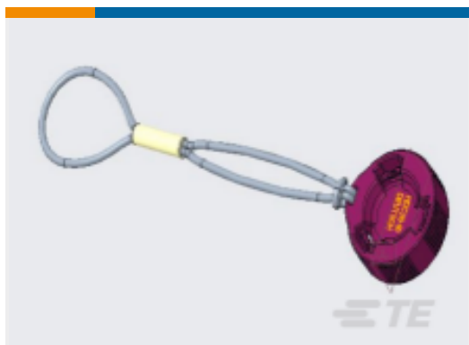
TE Part #HDC26-18-JDL COVER HDP 18 SHL RC RUBBER LYD