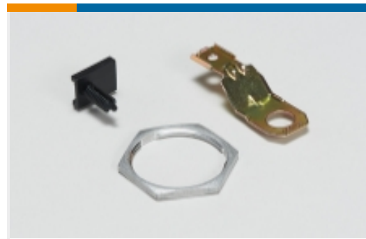
Other Automotive Connector Accessories(11)