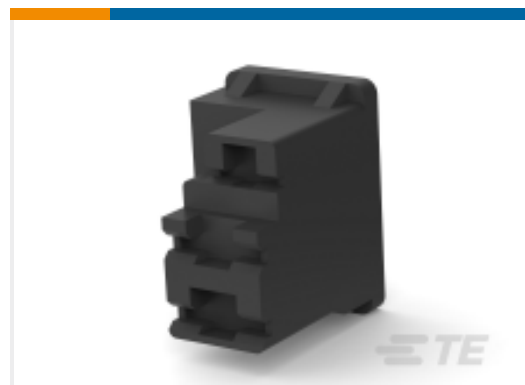
TE Part #341352 ALTERNATOR CONN.HSG.BLACK