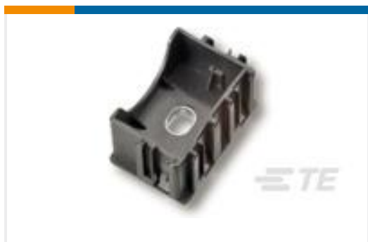
TE Part #2141031-1 FIXATION,BRAKET FOR BOX,ASSY