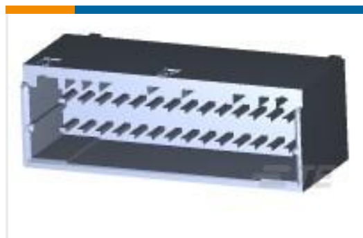
TE Part #1-1827872-5 DYNAMIC 1100D HDR ASSY V 30P X BLACK